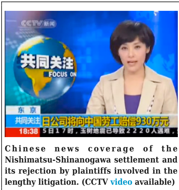
Chinese news coverage of the Nishimatsu-Shinanogawa settlement and its rejection by plaintiffs involved in the lengthy litigation.

As the agent of the Chinese plaintiffs, the author therefore issued a protest letter to Nishimatsu on April 19, 2010, but the corporation has not made any response. In the Settlement Agreement signed on April 26, 2010, Nishimatsu continued to include the plaintiffs who had already openly stated their rejection of this Settlement Agreement in its "settlement" arrangements. While Nishimatsu has yet to resolve its wartime forced labor issue, it violates de facto the human rights of the Chinese forced labor victims once again.