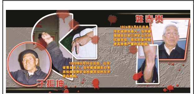
Chinese-language materials used to rally support for the strong redress claim stemming from Chinese forced labor. The man at left worked at the Nishimatsu Yasuno site, while the man at right was pressed into unpaid service for Mitsui & Co.

As the Nishimatsu-Shinanogawa settlement negotiation stemmed from the lawsuit claims for damages by the plaintiffs, both parties established the principle at the initial stage of negotiation that the plaintiffs in the litigation be the representatives of the victims' side throughout the negotiation.