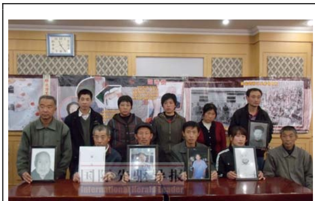
The five plaintiffs in the Shinanogawa lawsuit against Nishimatsu, along with heirs of two other victims, announce their opposition to the compensation pact at a Beijing press conference on April 27.

The truth is that all the plaintiffs of the Nishimatsu-Shinanogawa forced labor lawsuit in Japan, who were confirmed by both Nishimatsu and the plaintiffs' Japanese attorneys in June 2009 as the representatives to negotiate with the company, did not sign any settlement agreement with Nishimatsu. The root cause for this are: (a) Nishimatsu insisted to state in the content of the Nishimatsu-Shinanogawa Settlement Agreement [2] that "Chinese people's right to claim had been waived", but did not allow the plaintiffs to express side by side in the Settlement Agreement that they could not accept this wrong viewpoint; (b) In order to make clear its unyielding position of not taking any legal liability, Nishimatsu deliberately uses the term "atonement money (償い金)" to ambiguously name the damages that they should have paid to the Chinese victims; and (c) Moreover, Nishimatsu unreasonably requires those who accept the "settlement" to bear hereafter the obligation of ensuring that the corporation will be immune from any future liability from any other parties for this case. This article discusses these and other shortcomings of the unacceptable "settlement" in detail.