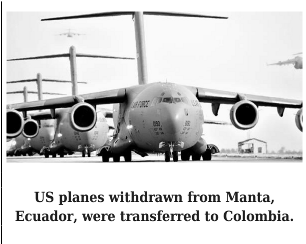
US planes withdrawn from Manta, Ecuador, were transferred to Colombia.

In Spanish, Ecuador means "equator". Manta is a port town facing the Pacific Ocean in the west of the country. On the coast is a large Ecuadorian air force base. From 1999, the American military had been using the base as a Forward Operating Location (FOL).