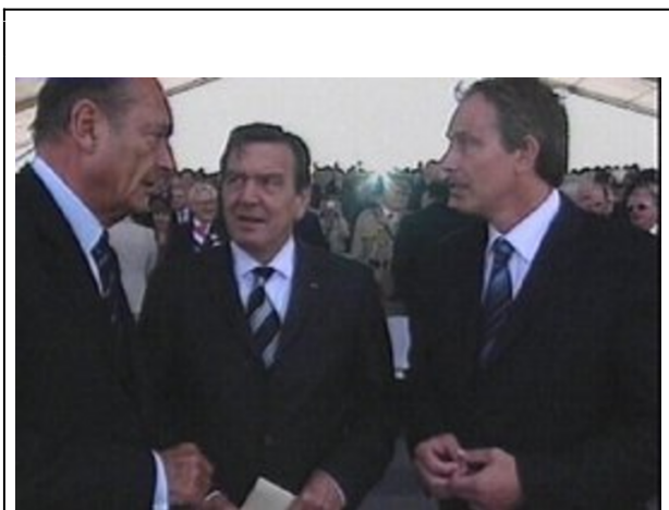
Chirac, Schröder and Blair at D-Day

prolonged German unwillingness to provide restitution to Czech victims of Nazism; and the planned Expulsion Center in Berlin. In the case of Israel, the past has also returned, both in the statements of the German literary figure Martin Walser about the oppressive obligation to memorialize the Holocaust, and in anti-Semitic statements of the mainstream German politicians Jürgen Möllemann (FDP) and Martin Hohmann (CDU). Like Polish leaders, Israeli leaders have warned Germans not to confuse victims and perpetrators. Concerning anti-Semitism in Germany, while the Israeli government has expressed concern, as Germany's partner in reconciliation it has also lauded the German government's efforts to combat this phenomenon. There are also recent, outstanding restitution issues for some citizens of Israel, which the German government has refused to recognize. We should note, however, that Germany has paid 62 billion Euros in total restitution and reparations payments since 1952 (about one third to individual Israelis and the state of Israel). Even in Franco-German relations, where the past has played a lesser role than in the cases of Poland, Israel and the Czech Republic, there was significant concern over President Jacques Chirac's 2004 invitation to Schröder to attend the commemoration of the sixtieth anniversary of D-Day.