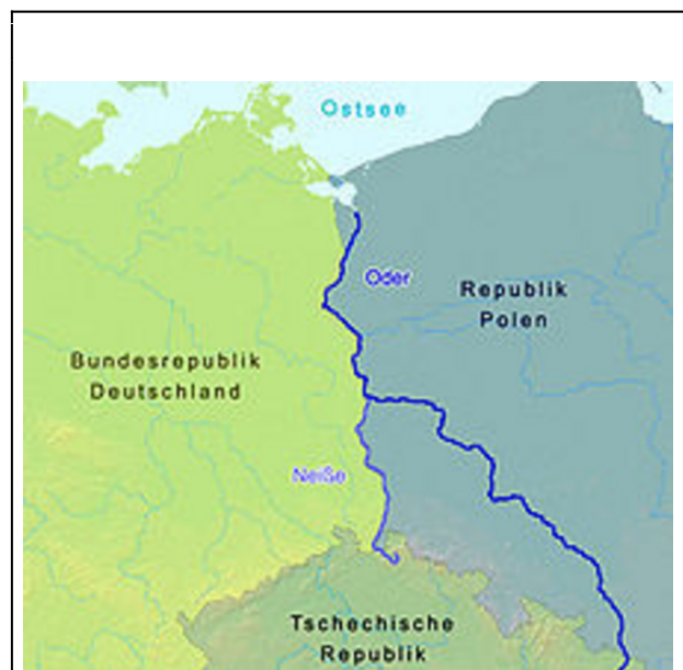
The 1970 Warsaw Treaty between Germany and Poland settled outstanding border issues with the Oder-Neisse line

The second stage of history’s shaping role in reconciliation, Germany’s acknowledgment of grievances, involved converting the affective, moral component into pragmatic and material needs and formal political commitment. In the Polish case, as with France, Israel and the Czech Republic, the acknowledgment entailed the language referring to historical issues in bilateral treaties and in major statements as well as symbolic expressions of reconciliation. For example, the December 1970 Treaty between the Federal Republic of Germany and the People’s Republic of Poland on the Basis for Normalizing Their Relations acknowledged Poland as “the first victim” of a murderous World War II and recognized the Oder-Neisse line as Poland’s western border, albeit de facto and not de jure. 13