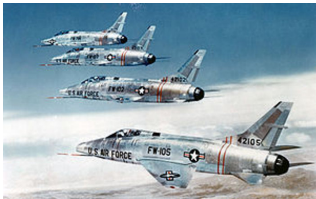
F-100s in formation

But I knew what it dealt with was all too real. I had seen some of the smaller bombs myself, H-bombs with an explosive yield of 1.1 megatons each—equivalent to 1.1 million tons of high explosive, each bomb half the total explosive power of all the bombs of World War II combined. I saw them slung under single-pilot F-100 fighter-bombers on alert at Kadena Air Base on Okinawa, ready to take off on 10 minutes' notice. On one occasion I had laid my hand on one of these, not yet loaded on a plane. On a cool day, the smooth metallic surface of the bomb was warm from the radiation within: a bodylike warmth.