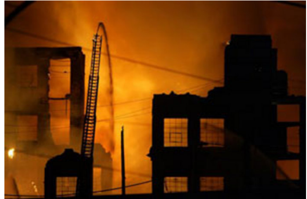
Firestorms caused by thermonuclear weapons would be the major cause of fatalities. The radius of firestorm damage would be two to five times the radius destroyed by blast.

The lowest number, at the left of the graph, was 275 million deaths. The number at the right-hand side, at six months, was 325 million.