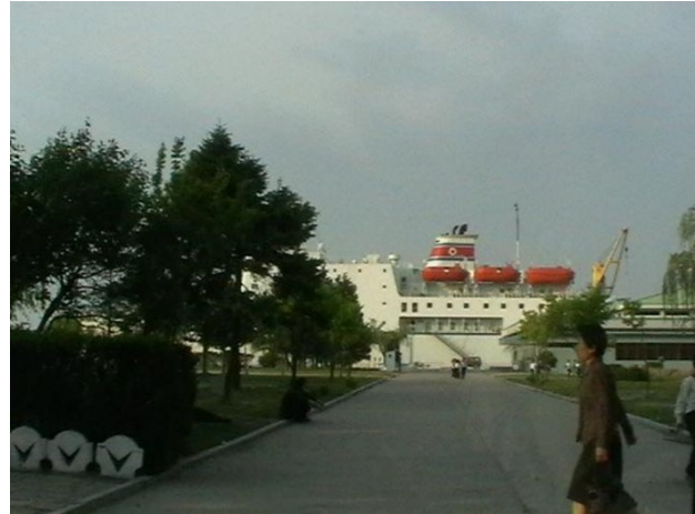
The ferry Mangyongbong 92, lying idle in the North Korean port of Wonsan, May 2009

Until the 1970s, it was almost impossible for Koreans who remained in Japan to visit their relatives in the DPRK: between 1963 and 1971, just 24 Zainichi Koreans, all of them aged over fifty, were given re-entry permits allowing them to visit ancestral graves or ageing relatives in North Korea and return to Japan. 29 During the 1970s Japan did move to ease some of the restrictions on visits to North Korea by Zainichi Koreans, 30 and in September 1971 the Mangyongbong , a North Korean cargo and passenger ship made its maiden voyage between Wonsan and Niigata, initiating a regular ferry link between the two countries. 31 In the 1990s this was replaced by a new vessel, the Mangyongbong 92 , but, following the DPRK’s nuclear test in 2006, the ship was banned from entering Japanese ports as part of Japan’s sanctions. In recent years, the general mood of fear and hostility towards North Korea has made it particularly difficult for Koreans with family links to the DPRK to maintain those connections, and ironically even means that the small number of former “returnees” who have managed to escape North Korea as refugees and return to Japan since the 1990s find it necessary to conceal their backgrounds for fear of attracting suspicion and discrimination.