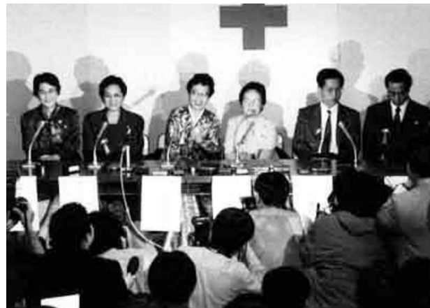
Members of the first group of “Japanese Wives” to be allowed to make a visit to Japan speak at a press conference at Narita Airport, Nov. 1997

Despite these limitations, negotiations on the “Japanese wives” issue did provide an opportunity for Japanese local government and NGO officials to travel to Pyongyang and meet their North Korean counterparts, thus gradually broadening the scope of communications between the two countries. A particularly important part in these discussions was played by the Japanese and North Korean Red Cross Societies, who (as we have seen) played central roles in the original mass migration. On 10 September 1997, the two societies reached agreement on the “Japanese wives” issue, and one month later (and unmistakably as a quid pro quo ) the Japanese government announced its major commitment of aid to famine-stricken North Korea via the World Food Program and ICRC. 37