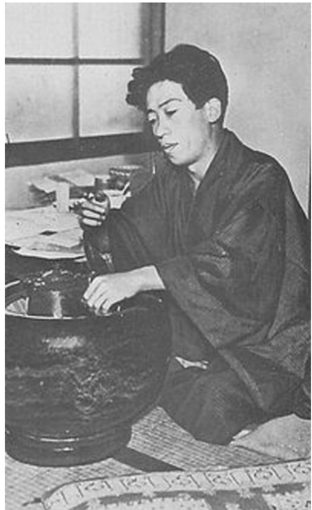
Kobayashi Takiji at work

This was the tragic end to the life of author and agitator, Kobayashi Takiji.