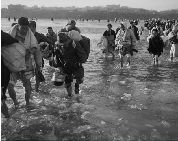
Koreans Fleeing Pyongyang braving the icy waters of the Taedong River. Photographed: December 10, 1950.