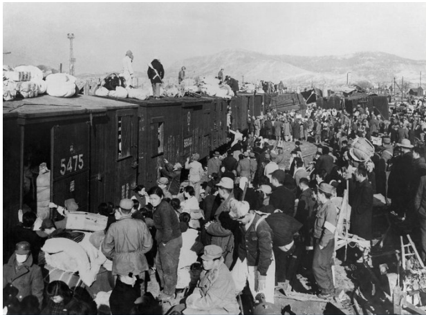
Refugees climbing on trains. Photographed: December 25, 1950

At the conclusion of the fighting, Korea lay in ruins. But the war never ended. It was stalemated in what was supposed to be a temporary armistice agreement. No peace treaty has ever been signed nor has normalization of relations been achieved between the principle antagonists, the Republic of Korea (South Korea) and the United States on one side, and the Democratic People's