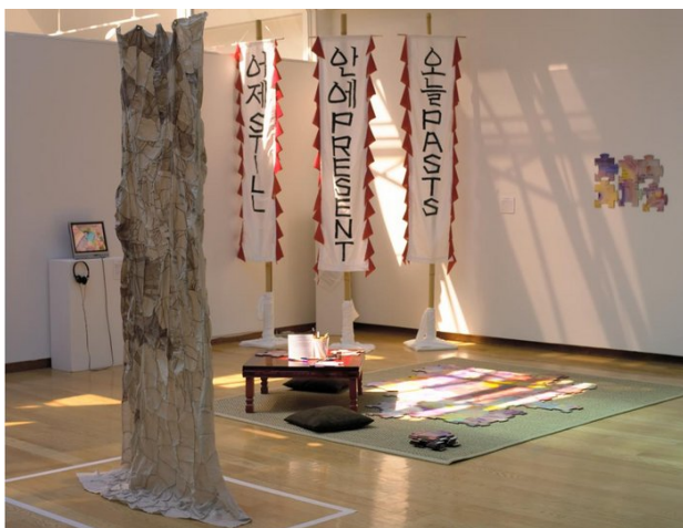
Wellesley Gallery.tif Jewett Art Center, Wellesley College.

The stories of the three performers are woven together by a thread of oral history voices that speak of bombings, deaths, evacuations, struggle, survival and eventual immigration to the U.S. Performed live, a video recording of “6.25” is also installed in the exhibit with other pieces embodying the myriad of legacies that connect contemporary life to a past of war.