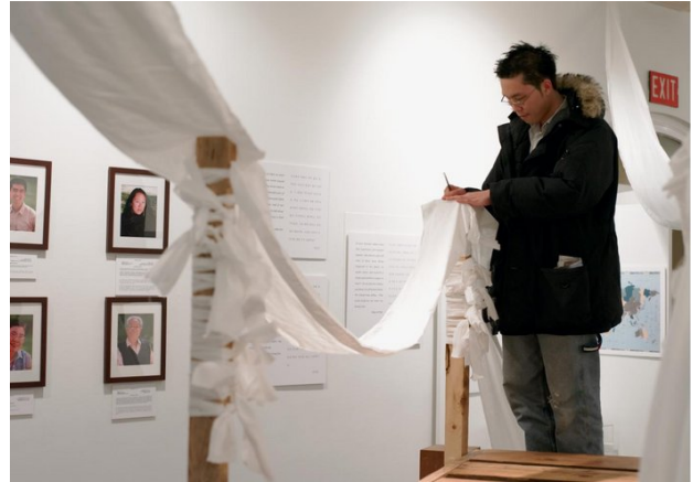
Exhibit visitor writes a message.