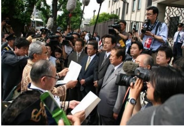
The chairman and directors of the Hokkaido Utari Kyōkai present demands to Hokkaido politicians during a demonstration on 22nd May 2008

The Japanese government's position has, until now, been unwavering. Even in the earlier report of policy suggestions made by the Council of Experts on Implementation of Countermeasures for the Ainu People ( Utari taisaku no arikata ni kansuru yūshikisha kondankai ), submitted in April 1996, and which led to the formation of the Ainu Cultural Promotion Act, it was said to be "impossible to put the right of self-determination which relates to a decision of political status, such as separation/independence from our country, or to the compensation/restoration of resources and land in Hokkaido, into the basis of the implementation of new measures for the Ainu people" 14 . Ever since the submission of this report, this has remained, and has been quoted, as the government's official position. Now, however, it would seem that the provisions made in Article 46 of the UN Declaration have inexorably ensured the state's final decision as to what might constitute a "partial imparity" to its "political unity". Japan's state machinery is now able to recognize the Ainu as indigenous on their own terms.