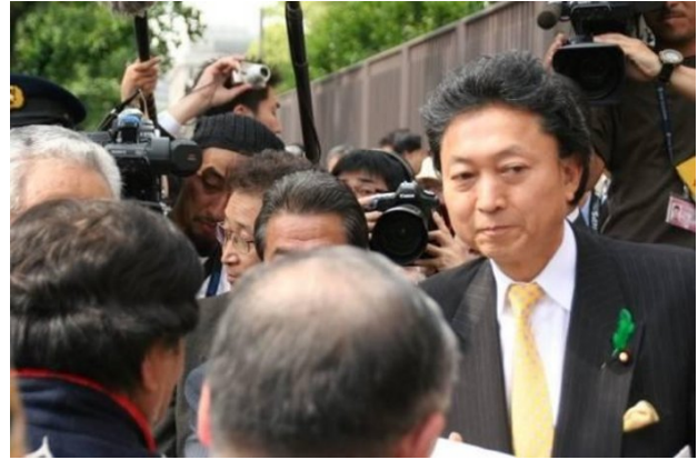
Suzuki Muneo in Ainu garb and Hatoyama Yukio greeting marchers during the May demonstration, a month prior to indigenous recognition.

In spite of the packaging, at base, however, there has been very little difference between the structure of these recent developments and those which led to the creation of the Ainu Cultural Promotion Act more than ten years ago 24 . The political meanderings that set the stage for the drafting of that Act took place during the 1990s realignment of Japanese politics, in which the LDP lost power for the first time in the postwar era. It was drafted and legislated during the switch between the Japan Socialist Party-led Murayama Cabinet and the newly revamped LDP government of Hashimoto Ryūtarō. Indeed, it is possible to group the Ainu Cultural Promotion Act together with a number of other flawed initiatives - or political full-stops - that the Murayama government introduced to try and put an end to the so-called "1955-system" of LDP-led politics. These would have to include the Atomic Bomb Survivors Assistance Act of 1994 and the Asian Women's Fund set up in 1995 for former "Comfort Women" which excluded the possibility of direct state compensation, but were hyped as important moves on issues that had been left dormant by previous consecutive LDP governments 25 . In actual fact, what these policies finally achieved was to clear the way of both social and postcolonial baggage for what