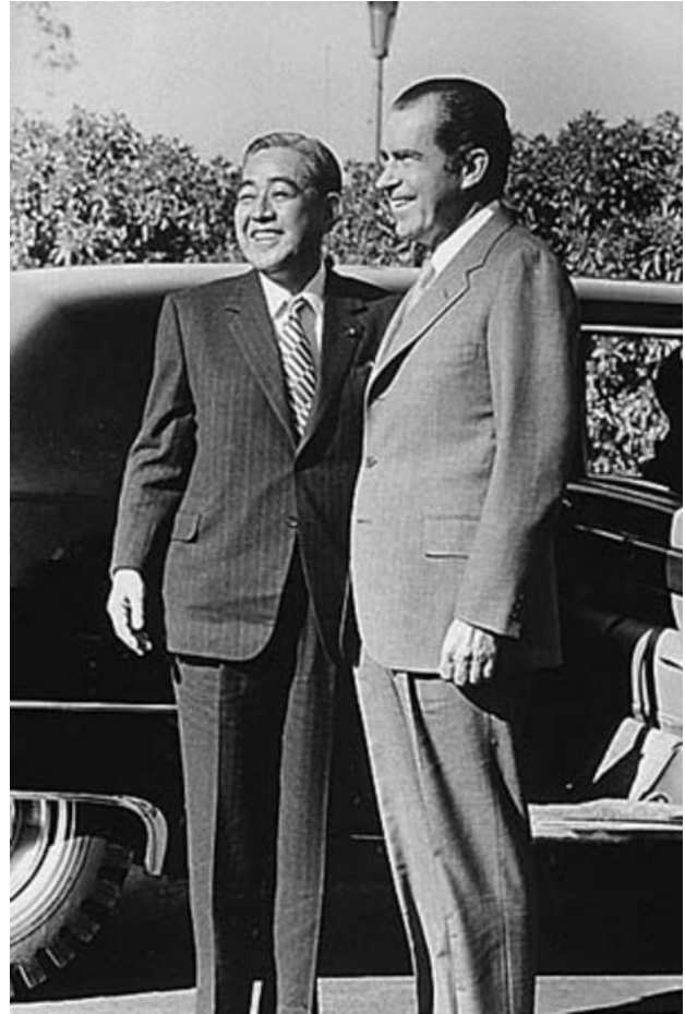
President Richard M. Nixon and Japanese Prime Minister Eisaku Sato meeting at the Western White House in San Clemente, California in January 1972. Nixon and Sato worked out the final details of the Okinawa reversion agreement during these meetings.

The two secret agreements were negotiated during the Cold War, when the United States Navy routinely transited Pacific waters with nuclear weapons onboard and the possibility of a U.S.-Soviet nuclear war was a matter of routine military planning. One of the agreements was actually a record of discussion that established an agreed and carefully defined interpretation of U.S. commitments regarding nuclear weapons, negotiated in 1960, that allowed transit of nuclear weapons through Japanese territory and waters, relegating the consultation requirement to the introduction and basing of nuclear weapons in Japan. The other was part of the 1969 agreement reverting Okinawa to Japan: U.S. nuclear weapons on Okinawa would be withdrawn but re-introduction would be possible in an emergency. Even after the end of the Cold War, which brought the worldwide withdrawal of all U.S. theater nuclear weapons, the U.S. government deferred to the Liberal Democrats on the need to keep the agreements secret, but that need is clearly now moot. Declassification is possible and necessary because determining what Tokyo and Washington actually negotiated is a question of significant historical importance and a key missing piece in the nuclear history of the Cold War.