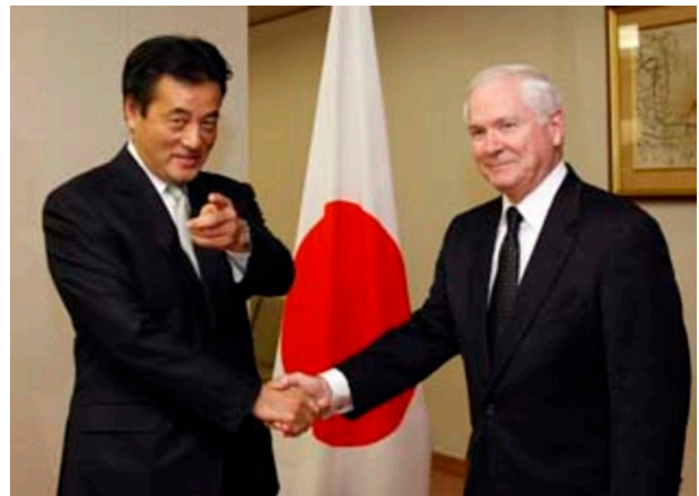
Okada (left) and Gates

One of the Democratic Party’s campaign pledges during the September election was establishment of an “equal partnership” with the U.S. based on Japan’s national “independence.” When Robert Gates, the U.S. Secretary of Defense, visited Japan in late October, he pressed Okada and Kitazawa Katumi, the Minister of Defense, to make sure that Japan’s official investigation of the secret deals would not harm the U.S. policy of nuclear deterrence and the U.S. – Japan relationship.