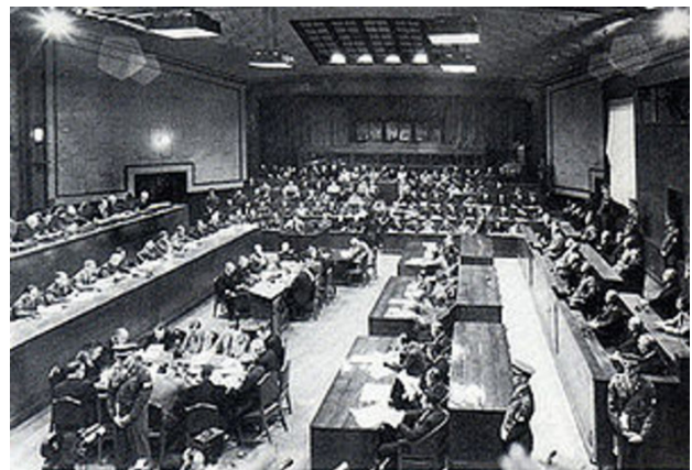
The International Military Tribunal for the Far East in session