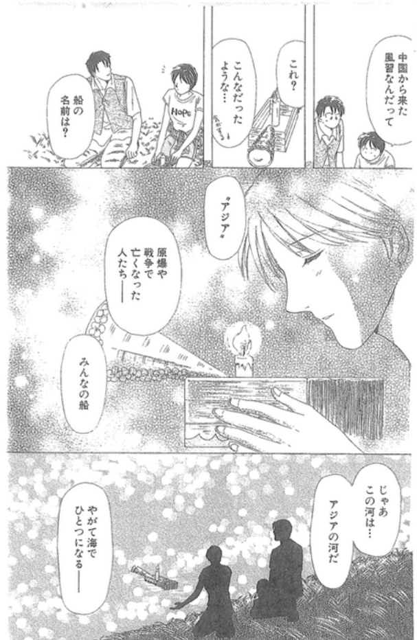
Kana and Soyon launch a "spirit boat" in the name of all who perished in the Asia-Pacific war. Nishioka Yuka, 2008. Courtesy of Gaifū Publishing Inc.

and Soyon build and launch a "spirit boat" that they name "Asia" for all who passed away in the war.