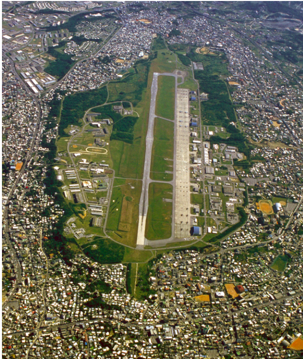
Futenma Marine Air Station surrounded by Ginowan City

US bases remain intact, taking up one-fifth of the land surface of Okinawa's main island. Nowhere is more overwhelmed by the US military presence than the city of Ginowan, which has grown around the US Marine Corps Futenma Air Station. The US and Japan agreed in 1996 that Futenma would be returned, but made return conditional on construction of a replacement, which would also have to be in Okinawa, and not just anywhere in Okinawa but in environmentally sensitive north, the coral and forest environment of Henoko in Nago City, where a precious colony of blue coral was discovered only in 2007, where the internationally protected dugong graze on sea grasses, turtles come to rest, and multiple rare birds, insects, animals thrive.. Thirteen years on, there the matter still stands.