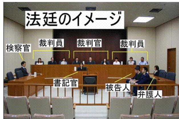
Simulated courtroom scene showing lay advocates ??? judges ??? defendant ??? prosecutor ??? defense counsel ??? and court stenographer ??? "

the judicial system and . . . their confidence in it.”[6] The Act aims to achieve this objective via the appointment of lay assessors to serve alongside professional judges in designated cases. It does not affect pre-existing rules and conventions concerning public access to court hearings or court files such as restrictions imposed on reporters through courthouse “press clubs” or other issues related to public understanding of trials and the legal system. Regarding the role to be played by lay assessors, despite the declared mission of promoting public understanding, the Act strictly prohibits assessors from disclosing any information from or pertaining to the panel’s deliberations.