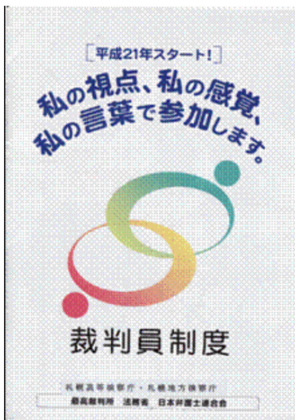
"The Lay Assessor System: Participating with My Opinions, My Sentiments, and My Words" -- cover of undated Supreme Court pamphlet for public distribution, 2006.

On May 21, 2009, lay citizens will join professional judges in deciding the fate of suspects of major crimes in Japan's new saiban-