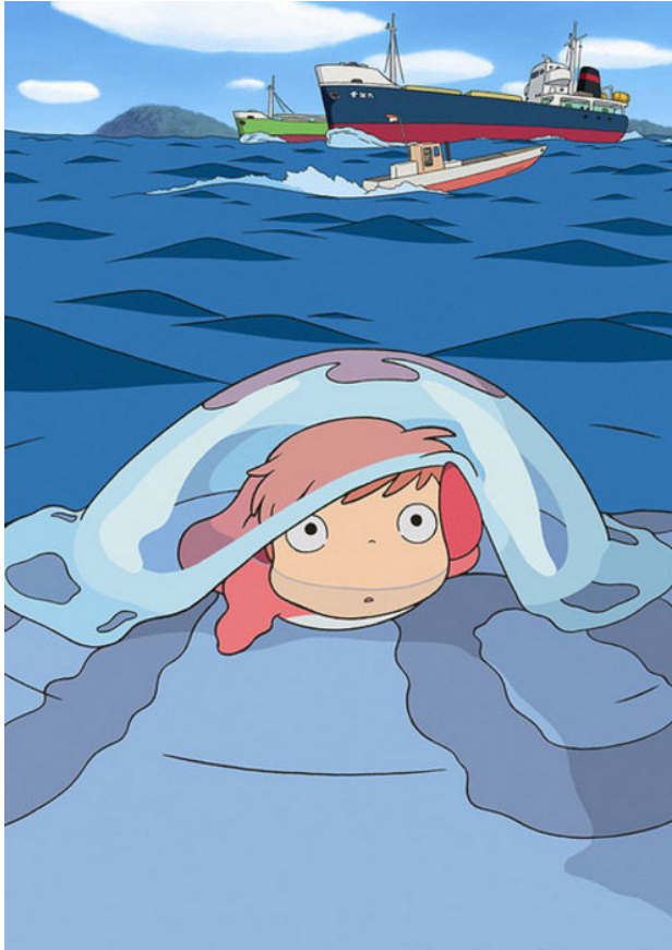
Ponyo on the Cliff still

Miyazaki's 10th movie, the story of a young goldfish that longs to become human, is another chapter in his lifelong struggle to interpret the world of children, explains the director, who says Ghibli has recently built a crèche for its staff where he spends a lot of his time. "I look at them and try to see things as they do. If I can do that, I can create universal appeal." The relationship is two-way, he says. "We get strength and encouragement from watching children. I consider it a blessing to be able to do that, and to make movies in this chaotic, testing world."