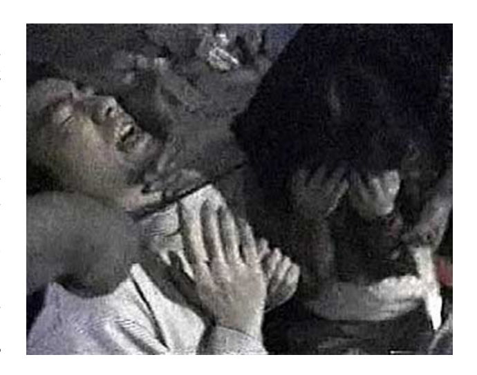
Image from video showing hostages threatened with knives

The kidnapping of the Japanese, and soon, dozens of other international civilians by various militia groups, portended a reversal of the purported imminent American victory. It occurred just one week after the grisly murders, on 31 March 2004, of four American contractors whose bodies were dragged through the streets of Fallujah, hung on a bridge and beaten. The kidnappings of Japanese, Korean and other civilians not part of the original U.S.-UK-led assault on Baghdad furthered the perception that major hostilities, despite Bush's "mission accomplished" declaration, were increasing rather than declining. Videotaped scenes of the captors holding guns and knives to the Japanese citizens' necks and denouncing the invasion were shown widely across the world (and later featured in Michael Moore's documentary film, Fahrenheit 9/11). In the video, the captors claimed they would execute the three civilians if Japan did not pull out its troops within three days.