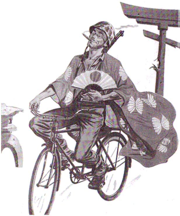
Colliers magazine cover depicting US-GIs in the thrall of Japan