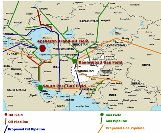
Map showing Central Asian completed and projected pipelines

All geopolitical junkies need a fix. Since the second half of the 1990s, I've been hooked on pipelines. I've crossed the Caspian in an Azeri cargo ship just to follow the $4 billion Baku-Tbilisi-Ceyhan pipeline, better known in this chess game by its acronym, BTC, through the Caucasus. (Oh, by the way, the map of Pipelineistan is chicken-scratched with acronyms, so get used to them!)