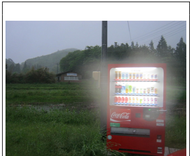
A single Coca-cola vending machine in a field in the evacuated hamlet of Nagadoro on 30 May 2011

is unclear whether a safe and reassuring environment will result; nor can I understand why they are once again planning to put the local people's lives at risk by making them go back before it is safe. Goodness knows how many billions of yen the work will cost, but the village office's estimate for Iitate village alone is 322 billion yen (over $3 billion).