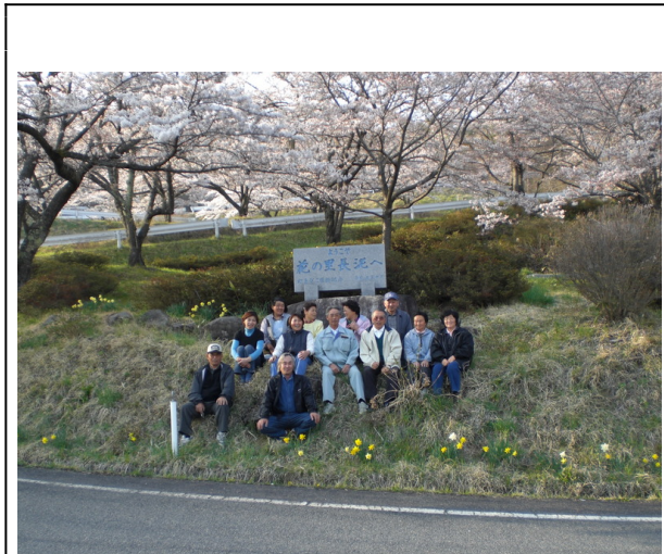
A cherry blossom party at Nagadoro in the days before the disaster

A Statement by one of those who lost their homeland to the Fukushima nuclear disaster