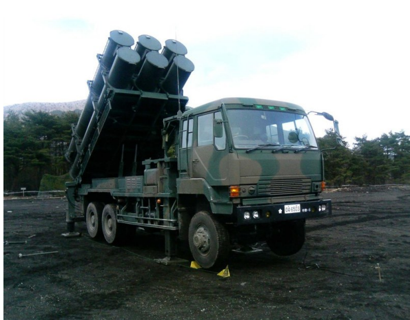
Truck carrying Type 88 missiles. Also known as SSM-1 or Shibusuta, this missile was developed by Mitsubishi Heavy Industries from the Air SDF Type 80 (ASM-1) air-to-surface anti-ship missile. 28

Conclusions. Increasing tensions in Asia make it necessary to examine the different strategies of the actors involved, Japan among them. Most observers hope that some sort of diplomatic settlement will ultimately be reached. In support of such a view they cite factors such as the economic interdependence between the different countries involved, the high costs in material and human terms of an open conflict, and the fact that public opinion indicates ambivalence concerning resort to arms against neighbors. Diplomacy and military might, however, are not two completely unrelated spheres, and a country's weight in the former usually depends to some extent on the capabilities and credibility of the latter. This is why, although rearmament and the development of new military capabilities by Japan's SDF are only one of the legs in Tokyo's strategy to deal with tensions in Asia, defending her national interest while seeking to avoid open conflict, it is necessary to examine moves in this area. This may facilitate a clearer view of Japan's diplomatic options, as well as the perceptions by her neighbors, including