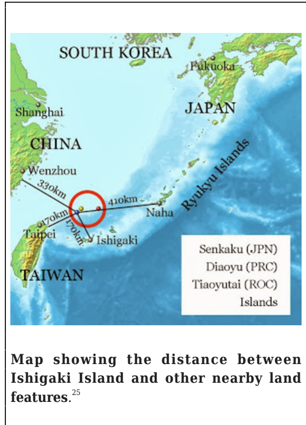
Map showing the distance between Ishigaki Island and other nearby land features. 25

in conventional naval capabilities across the Taiwan Strait.