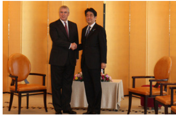
Abe's coded message to Beijing: shaking hands with Falklands veteran, His Royal Highness the Duke of York. 30

The 400th anniversary of UK-Japan relations seems to be providing cover for Japan's deterrence diplomacy. Next year, the 100 anniversary of the First World War, where Japan and the UK fought together, may provide further opportunities for the Japanese prime minister to send subtle messages to China and to Tokyo's allies. In his keynote address at the RUSI conference, Abe noted how the Japanese Imperial Navy came to be known as “the guardian of the Mediterranean”. Can Japan combine a no-nonsense approach to national security without incurring excessive military spending and/or prompting accusations of militarism at home and abroad? That is a key question, and one on which the Japanese Government seems to be looking to the UK as a possible role model, or at least recalling the heydays of the Anglo-Japanese Alliance at the dawn of the twentieth century, when Japan was widely respected as a regional power without being seen as an outcast and a bully as in the 1930s. One of the main challenges is selling this to South Korea, a country clearly reluctant to see Tokyo play a stronger role in international, and particularly security, affairs.