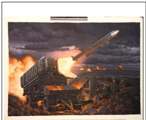
Artistic rendering of the launch of an Exocet by the ITB. 29

Among others, Tokyo is trying to reinforce economic and political relations with a wide range of actors. These include ASEAN member states, India, and Mongolia, just to mention a few. Prime Minister Abe Shinzo also seems to attach great importance to improved relations with Russia, and this is matched by a corresponding interest by Russian leader Putin. It is reinforced by both countries' needs for energy trade diversification, Russia as exporter and Japan as developer and importer. Moscow and Tokyo show how territorial disputes and historical mistrust are not necessarily an obstacle to better relations, when the political will and economic incentives are there on both sides. Japan has also been quick to assist the Philippines recover from Typhoon Haiyan / Yolanda, in a move made the more important since it is one of the countries that Imperial Japan occupied during the Second World War. On the trade front, while facing a number of obstacles, Tokyo is one of the actors clearly interested in a successful outcome to the Trans-Pacific Partnership (TPP) negotiations.