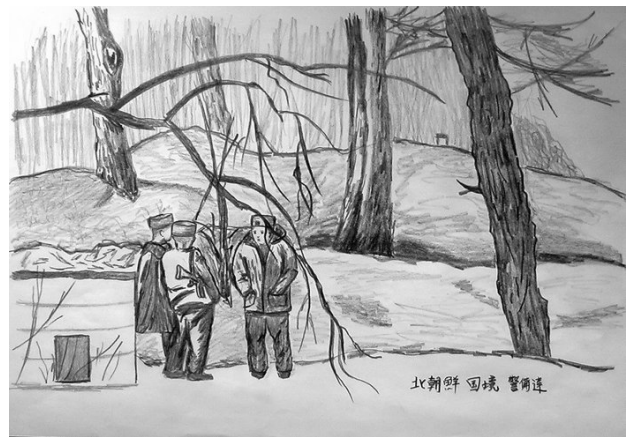
Border guards. Picture of the North Korean border drawn by a refugee

are now in the 40s) may never be able to acquire really high levels of Japanese-language competence. Some are filled with passionate anger towards the North Korean regime because of their tragic experiences, while others have no interest in politics. Some, meanwhile, also feel that the Japanese government bears a large measure of responsibility for their fate.[57] Any effective response to the needs of refugees, then, must be able to encompass and respond to this diversity. Surely the last thing that the repatriate-refugees need is to become the test-case in yet another scheme for nationalist social engineering.