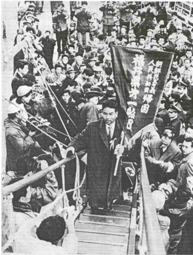
"To our dear fatherland!" The first one comes up the gangway