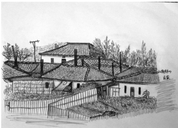
Picture of a North Korean village drawn by a refugee

The sense of uncertainty was particularly great for the substantial group of Koreans in Japan (possibly in the region of 100,000 people or more) who had become “illegal entrants”: that is Koreans who had entered (or re-entered) Japan in the period after 1945. One aspect of this uncertainty was the fact that there was no reliable way for Koreans in Japan to obtain re-entry rights if they left the country (for example) to visit relatives in Korea. As a result, many made undocumented journeys out of and back into Japan, thereby becoming “illegal entrants” who, if discovered, were liable to internment in Aomori Migrant Detention Center and repatriation to South Korea.