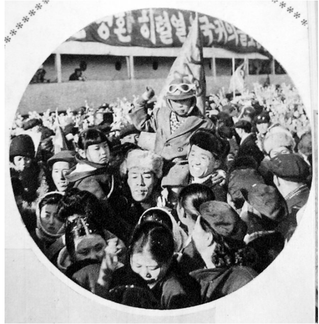
Repatriates arriving in Cheongjin

At 4 o'clock in the morning on 2 June 2007, a man out fishing near the port of Fukaura in Japan's Aomori Prefecture came upon a small boat with four people in it. The boat had left the North Korean port of Cheongjin one week earlier, and the people on board – a couple and their two adult sons – were North Korean refugees. [1] They were the first to appear on Japan's shores by boat since 1987, when eleven refugees from North Korea had arrived in Fukui on a boat called the Zu Dan 9082. The events in the sleepy little town of Fukaura briefly became headline news in Japan, igniting media debate about a possible impending influx of displaced people from the Korean Peninsula, and about the appropriate Japanese response to the North Korean refugee problem.