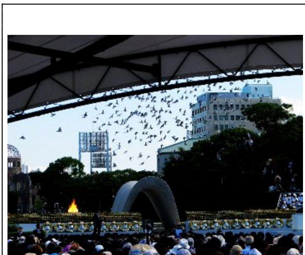
Doves released at Hiroshima Memorial Ceremony

press conference on August 5, “With respect to Hiroshima and the anniversary of the atomic bomb, this President, President Obama, is very committed to working toward a world without nuclear weapons...And I think that the Obama Administration and President Obama himself believed that it would be appropriate for us to recognize this anniversary and so has proceeded to do so.” 42 It was rare, and probably unprecedented, for a US Secretary of State to specifically comment on Hiroshima on the anniversary day. 43 The world media paid special attention to the fact that the US attended for the first time - with CNN, BBC, Aljazeera, Korea’s Yonhap News, China Central Television, and Russia’s ITAR-TASS, all reporting this. 44