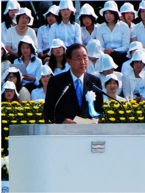
UN Secretary General Ban Ki-moon at Hiroshima Memorial, August 6, 2010

There was something, however, that I was expecting to hear in Ban's speech and did not—the idea of a Nuclear Weapons Convention (Convention on the Prohibition of the Development, Testing, Production, Stockpiling, Transfer, Use and Threat of Use of Nuclear Weapons and on their Elimination). Such a goal is supported by Ban, as well as by atomic-bomb survivors' organizations like Nihon Hidankyo , Mayors for Peace, and many other NGOs around the world. It was also mentioned, if rather subtly, in his "five-point plan to rid the world of nuclear weapons." 28 Ban said, "I especially welcome your support for the idea of concluding a Nuclear Weapons Convention," at the NGO Conference at Riverside Church, on May 1. 29 The idea of such a convention was included in the final document of the 2010 NPT Review Conference because of Ban's strong