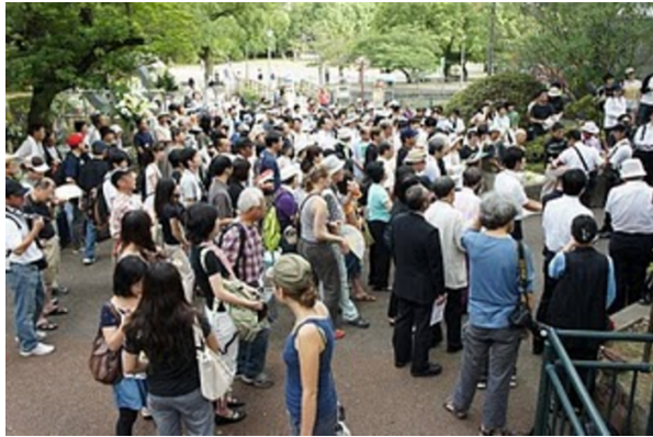
Memorial gathering for Korean victims of Nagasaki atomic bombing, August 9, 2010

could be related to the 100th anniversary of annexation, and Ban's visit to Nagasaki.