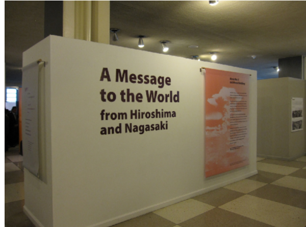
A-bomb Exhibit at UN Visitor Centre

This May, the hundred hibakusha were active in New York. For the first time, Hidankyo hosted a large A-bomb panel exhibit in the U.N. Headquarters' Visitor Centre's lobby, which ran from May 3 to the end of June. Hibakusha took turns attending the exhibit, answering questions and telling their stories to visitors. Hidankyo representatives met with Secretary General Ban Ki-moon, and wrote to all 192 member states of the U.N. requesting to visit their U.N. mission's offices. They were able to visit seven of them - Brazil, Malaysia, Japan, New Zealand, Sweden, and surprisingly, two nuclear weapon states, Russia and France. In fact, France did not respond, but French anti-nuclear activists who were in town for the conference brought Hidankyo delegates to their representative's office, and a meeting took place.