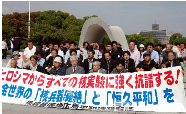
Hiroshima's protest against the first nuclear test under Obama administration