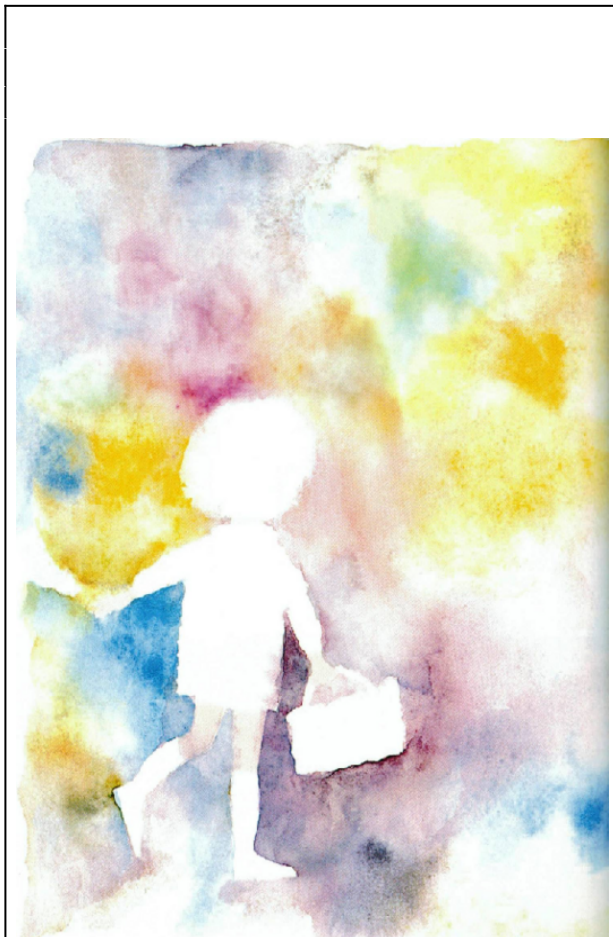
Illustration by Iwasaki Chihiro, from Inoue Hisashi's book, Japan's Constitution for Children 65

For myself, as powerless as or perhaps even more powerless than Oe, what I will do is to keep learning, keep walking, and keep acting, so no child ever has to pick up the charred body of her mother again.