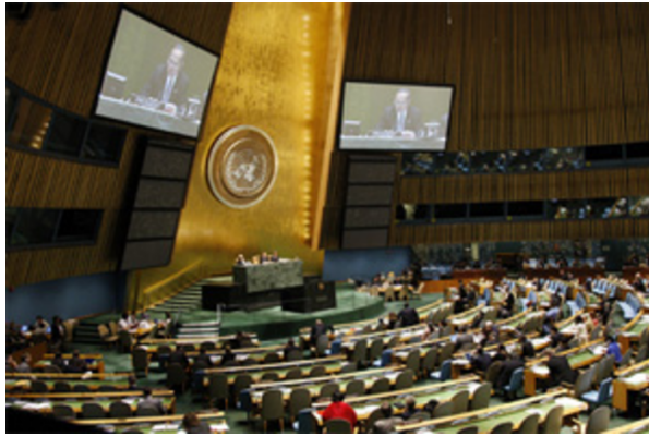
NPT Review Conference in the General Assembly Hall

There was general dissatisfaction among non-nuclear states that, during the course of the negotiation, nuclear states refused to set a clear timetable for total elimination of nuclear weapons or to hold a conference for disarmament in 2014 to set a schedule for abolition. The idea of convening an international conference to formulate a roadmap for nuclear abolition, which was in the earlier draft, was eventually removed. 25 Nor was the deadline of 2025 sought by 118 nations of NAM (Nonaligned Movement states) for complete nuclear disarmament included in the final document. The plan for a 2012 Middle East nuclear free-zone conference appeared to be the most concrete agreement in the final document, but the US and Israel dissented immediately. Barack Obama “strongly opposed” Israel, the only nuclear power in the Middle East, being singled out. 26 (For a summary of media reports and assessments of NPT 2010, see Link .)