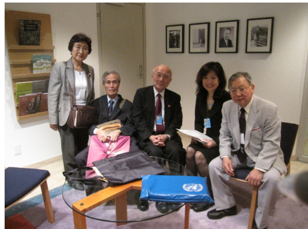
Hidankyo Executives at UN Swedish Mission 12

The hibakusha visited forty schools, telling their stories to local students. Another group of over one hundred people served as local volunteers, most of them bilingual Japanese-Americans, who contributed as translators and helpers for hibakusha during school visits, demonstrations, and conferences. The hibakusha, local volunteers, and international activists shared a real sense of camaraderie. The highlight of hibakusha activism in New York was the rally and demonstration held at Times Square on May 2 by volunteers and sponsors of peace and anti-nuclear