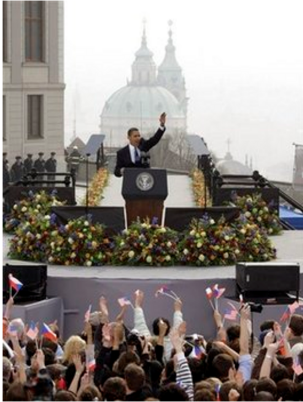
Obama speaking in Prague, April 5, 2009

This May, the hundred hibakusha were active in New York. For the first time, Hidankyo hosted a large A-bomb panel exhibit in the U.N. Headquarters' Visitor Centre's lobby, which ran from May 3 to the end of June. Hibakusha took turns attending the exhibit, answering questions and telling their stories to visitors. Hidankyo representatives met with Secretary General Ban Ki-moon, and wrote to all 192 member states of the U.N. requesting to visit their U.N. mission's offices. They were able to visit seven of them - Brazil, Malaysia, Japan, New Zealand, Sweden, and surprisingly, two nuclear weapon states, Russia and France. In fact, France did not respond, but French anti-nuclear activists who were in town for the conference brought Hidankyo delegates to their representative's office, and a meeting took place.