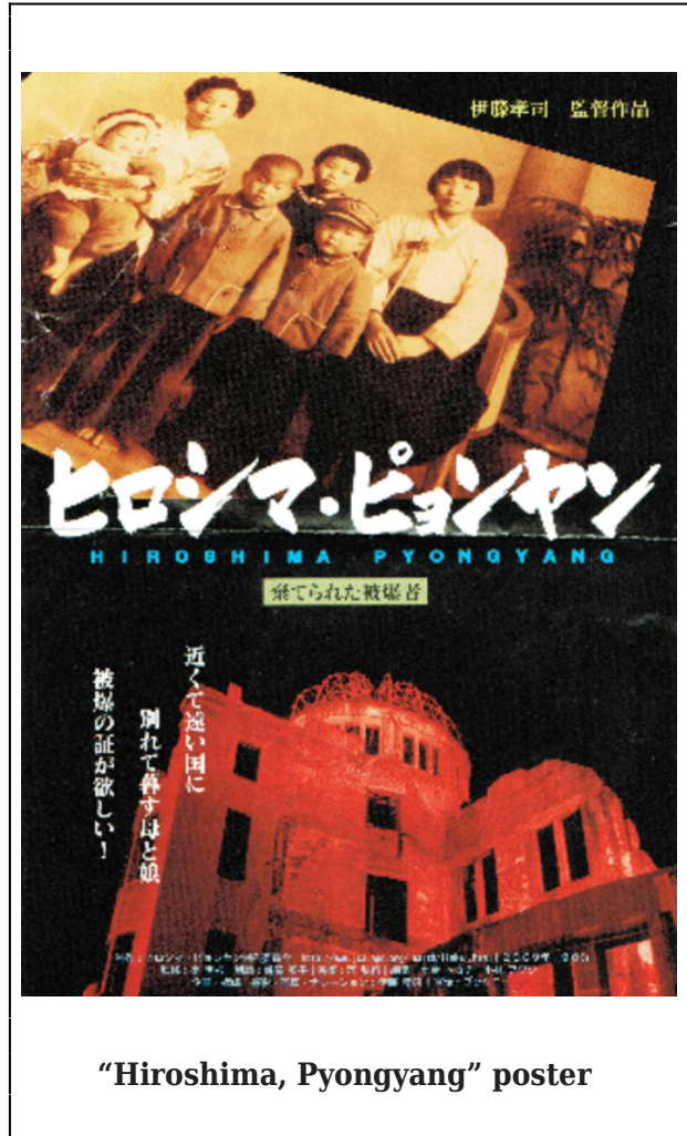
“Hiroshima, Pyongyang” poster