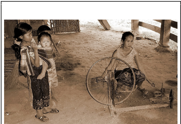
A woman in Xieng Khouang twists silk filament together to make warp thread. She wears a 'plain' woven silk sinh with sewn on woven edge ( tin sinh ). Her daughter wears a mutt mee ( ikat ) sinh with a less ornate tin sinh befitting younger girls.

The coarse ivory silk recently spooled from the cocoons gathered in her garden pushed back against her hand.