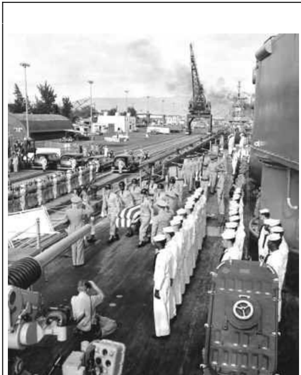
Unloading bones at Kokura

skeleton to be completed for each body. (The instructions on the diagram read, 'black out parts of body not received'). 27