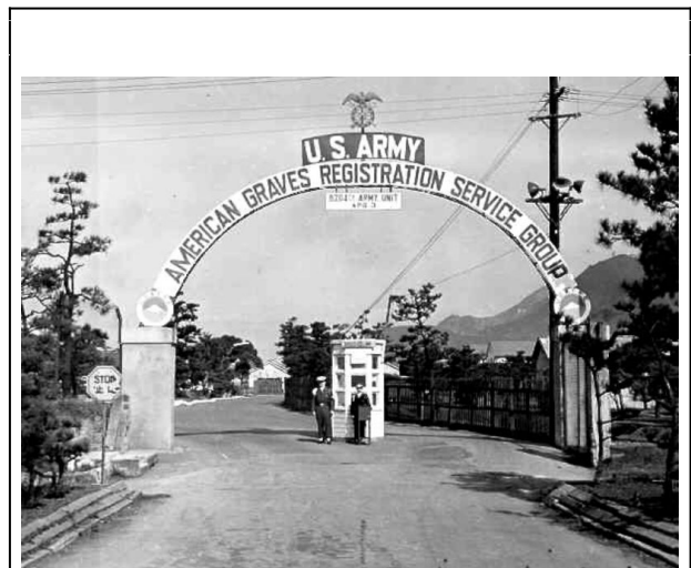
Camp Jono, Kokura, Japan