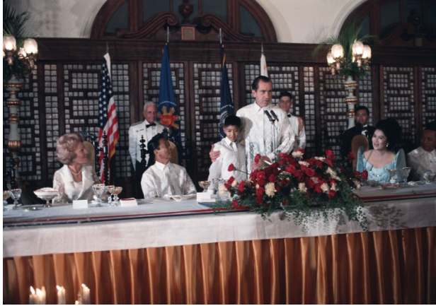
Marcos and Nixon