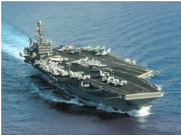
US Aircraft Carrier in the Persian Gulf

. . . demonstrates that military 'security' alone is never enough. It may, over the shorter term, deter or defeat rival states....[b]ut if, by such victories, the nation over-extends itself geographically and strategically; if, even at a less imperial level, it chooses to devote a large proportion of its total income to 'protection,' leaving less for 'productive investment,' it is likely to find its economic output slowing down, with dire implications for its long-term capacity to maintain both its citizens' consumption demands and its international position (Kennedy 1987:539).[5]