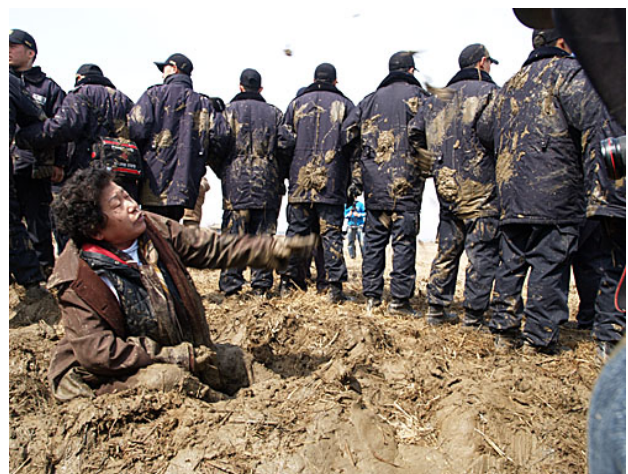
Korean farmer resisting police eviction to make way

The surrounding area, including the towns of Doduri and Daechuri, was home to some 1,372 people, many elderly farmers. In 2005, residents and activists began a peace camp at the village of Daechuri. The Korean government eventually forcibly evicted all from their homes and demolished the Daechuri primary school, which had been an organizing center for the resisting farmers.