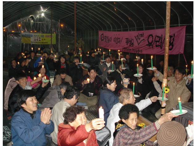
Farmers and supporters vigil, Pyongtaek

In South Korea, bloody battles between civilian protesters and the Korean military were waged in 2006 in response to US plans to relocate the troops there. In 2004, the Korean government agreed to US plans to expand Camp Humphries near Pyongtaek, currently 3,700 acres, by an additional 2,900 acres.