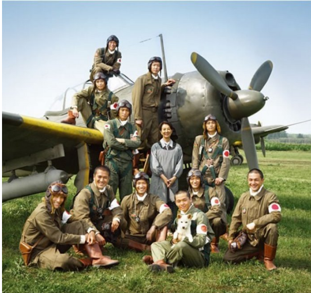
Promotional photo of the cast of "Ore wa, kimi no tame ni koso shini ni iku" (a literal translation of which is I will go to die for you above all), the controversial 2007 movie about a World War II kamikaze pilot written and produced by Ishihara.

famously in the 1989 polemic he wrote with Sony CEO Morita Akio, The Japan That Can Say No , a high-handed claim of Japanese superiority. He continues to offend China with his occasional use of the derogatory term “Shina” from the Japanese imperial era.