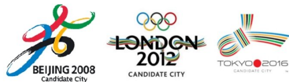
Official “Candidate City” logos of Beijing, London, and Tokyo

and the competition between London and Tokyo as global financial centers.