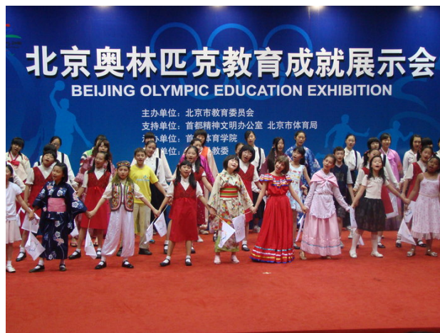
International song and dress at the Olympic Education Exhibition, May 2008.

considered to be "appearance-ism," I thought that teaching students that their country was taking its place among other nations as an equal, and that China would no longer be "bullied" by other nations, would have an important effect on the students for the future. He was silent for a moment, and then confessed that when he saw the Chinese flag being raised in the stadium and heard the wild cheering of the crowd, he had gotten tears in his eyes, and this had been the first time in his life that this had ever happened to him. From this perspective, he agreed with my conclusion. Our conversation took place during a dinner to which I had been invited so that I could advise him on whether to accept admission to the Master's Degree programs at the University of Pennsylvania or the University of Southern California, with an eye to which city would offer better future employment opportunities.