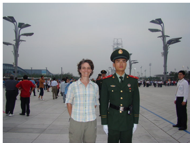
The author posing with a soldier guarding

(防暴警, literally “violence-prevention police”), had high visibility during the Olympic Games. This is a category of security personnel whose domestic numbers and functions had been expanded in 2005, at the same time that China also started sending riot police on U.N. peacekeeping missions. Clad in black, physically bigger (many are former wushu and judo athletes), and more highly trained and educated than the regular and armed police, they were brought out in large numbers to protect sensitive locations in Beijing. Their training drills were shown on CCTV in dramatic ways that promoted a positive image of them as anti-terrorist police ready to help evacuate a stadium in case of a bomb or to secure the release of innocent spectators taken hostage. The riot police are more frequently deployed to control the local populace than to deal with terrorists - indeed, on the night of the opening ceremony I watched them clear out the crowd that had gathered in the square at the central train station to watch the opening ceremony on the big-screen TV, when the security personnel decided the crowd was too big and the situation was dangerous. However, the effect of the Olympic coverage may have been similar to that described by Tagsold for the Japanese Self-Defense Forces - their image was improved by linking them with keeping the peace at the Olympics.