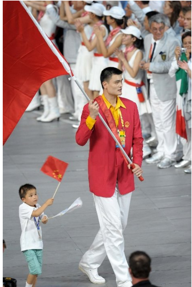
Yao Ming, flagbearer for China, enters the stadium with Lin Hao, earthquake survivor.

by the atom bombs, within China these symbols did preserve the Chinese narrative of victimization in the midst of the most grandiose Olympics ever.