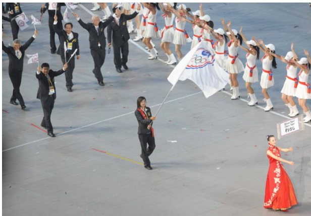
Chinese Taipei enters the stadium in the opening ceremony.

solved by having Taiwan march with the “T’s.” The problem was solved by inserting the Central African Republic between Taiwan and Hong Kong – since “China” literally means “central country,” the Central African Republic shares the character zhong with them. Ironically, the stroke order placed Japan before Chinese Taipei, but with Taiwan’s former colonial status no longer problematic for Taiwanese identity, this was not an issue.