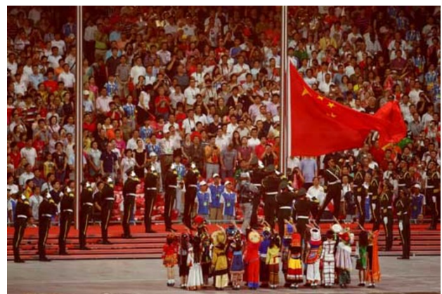
The raising of the Chinese flag in the opening ceremony.

One illustration of this point is a conversation I had with a Tsinghua University student who, as an Olympic volunteer, was standing beneath the flagpole when the Chinese flag was raised in the Olympic opening ceremony. He asked me what I thought of Beijing's Olympic education programs - didn't I find that much of it was just a "show" by the government? I told him that while many of the activities might be