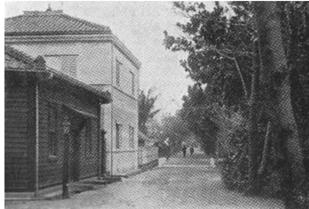
Bonin Island post office and main street

state through such authoritarian apparatuses as government departments, hospitals, schools and prisons. With Japan's modernization, the koseki, as an instrument of surveillance and control, became ubiquitous throughout processes of social administration.