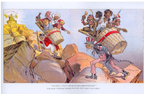
“The White Man’s Burden (Apologies to Kipling).” (Source: The Forbidden Book (2004) ed. Ignacio et al.).

“The White Man’s Burden: The United States and the Philippine Islands.” In the midst of debates over the United States’ involvement in the Philippines, the poem spread quickly. In it, Kipling advised the United States to take its place alongside Great Britain and make the sacrifices necessary for the civilization of those “half devil and half child.” However, it was also the inspiration for many anti-imperialist counter-poems, serving as a phrase for anti-imperialist ridicule because of contradictions between violence and civilization.