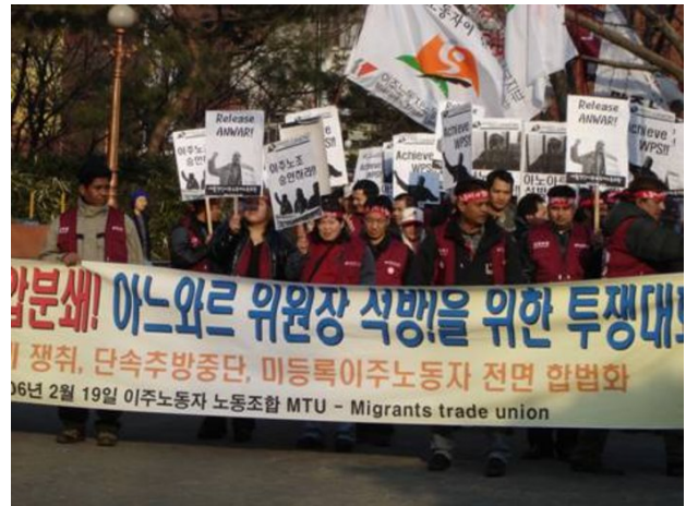
A protest organized by the Migrants Trade Union (MTU), an organization of foreign workers in South Korea, February 18, 2009

of Koreanness that determines who is, and who is not, classified as Korean.