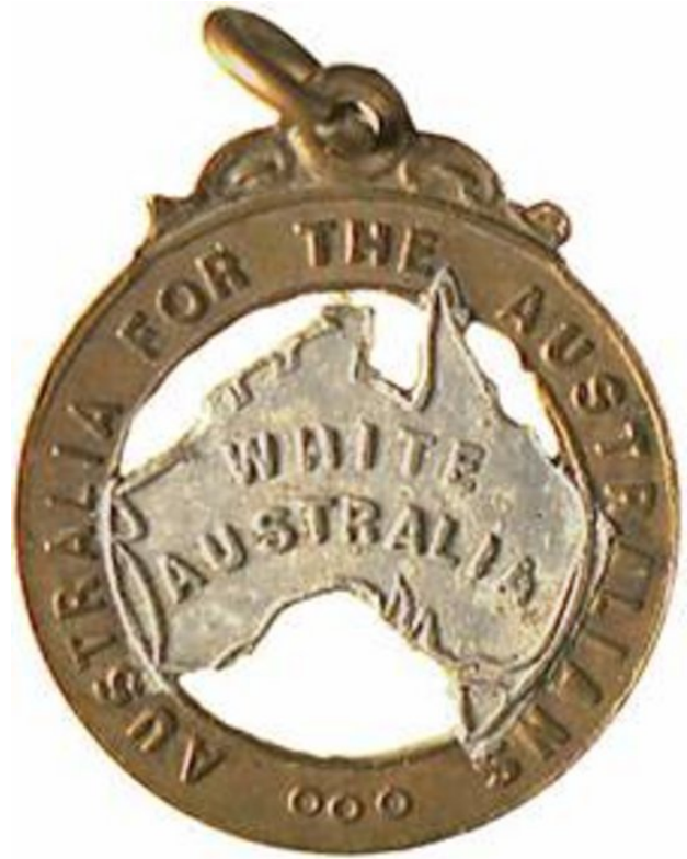
This badge from 1906 shows pride in “White Australia”

The logical extreme of the White Australian policy was manifested in the discussions among the governing elite (from the 1930s to 1950s) to “biologically absorb” and/or culturally assimilate the decidedly non-white Aborigine population, although for a long time the question of “where Aborigines fitted into the white nation was generally fudged or ignored for as long as they seemed headed for inevitable extinction.”[49] Ultimately, a policy of assimilation was adopted, but it was one that clearly reflected the then-prevalent and unequivocally racist discourse on the need to maintain national homogeneity (a “pure race”) as the source of national cohesion and national progress. Under Australia’s assimilationist policy (which was officially adopted in 1937, but not formally implemented throughout Australia until 1951), a conscious effort was made to exterminate Aboriginal culture; as part of this policy, children were forcibly taken from