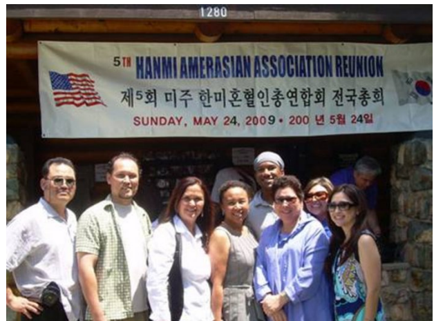
A membership meeting of Korean Amerasians, held in Fullerton, CA, May 24, 2009

There is, finally, an “endogenous” source of diversity: the children of international marriages. As the number of international marriages has increased, so too has the number of “multicultural children.” Amerasians, as I noted above, has been part of South Korea since the 1950s, but their numbers have always been relatively small due, in part, to overseas adoptions (and, of course, some emigrate to the United States with their American fathers).[29]