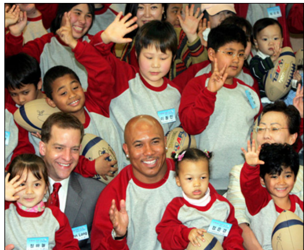
Hines Ward (bottom, center), on his visit to South Korea in April 2006, participates in an event held by the Pearl S. Buck International Foundation in Seoul

advertisements in Korea. Ward received a “hero’s welcome” on his first visit to his “motherland” in April 2006. The tacit, if unintentional, message underlying these stories was that neither pure blood nor culture is a necessary attribute of Koreanness. After all, Ward’s blood is “mixed” and he grew up in the United States where, as a young man, he learned almost nothing about his Korean heritage or Korean culture, including how to speak Korean. Ward’s embrace, it is important to emphasize, was different from that of other Amerasians or “mixed blood” entertainers or sports figures in South Korea (as well as in Japan and other Asian countries): he sparked a significant national debate on Korean identity and the country’s “shameful” history of discrimination. Even more, Ward’s success provoked a number of immediate policy changes. Shortly after his visit to South Korea, for example, the Ministry of Education announced that middle school textbooks would no longer describe Korea as a “nation unified by one bloodline,” but instead speak of “a multiethnic and multicultural society.”