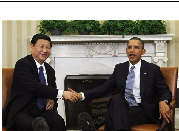
Xi Jinping with Obama, February 15,

President Xi Jinping's call for a "new type of great-power relationship" in meetings in 2013 with President Obama raises important questions about the future of US-China relations. On the surface, it appeared that the two leaders were on the same page. At the June summit, Obama agreed with Xi that "working together cooperatively" and bringing US-China relations "to a new level" were sound ideas. 1 When the G-20 countries convened at St. Petersburg in September, Obama said of Xi's proposed new model: "we agreed to continue to build a new model of great power relations based on practical cooperation and constructively managing our differences." But he added that "significant differences and sources of tension" remain with China, implying that China's "playing a stable and prosperous and peaceful role" in world affairs remained a matter of US concern. 2