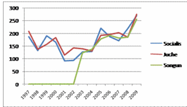
Number of KCNA articles with the terms "socialist/socialism", "juche" and "songun" in the 4th quarters 1997-2008, and the 1st quarter 2009

Among the new old buzzwords are single-minded unity (ilsimtan'gyŏl), collectivism (chiptanjuŭi), self-reliance (charyŏkkaengsaeng) and mental power (chŏngsinryŏk). Today, it is hard to believe that back in January 2002, People's Korea quoted Kim Jong-il as pointing "to the fact that foreign trade should be conducted in accordance with the mechanism and principles of capitalism."