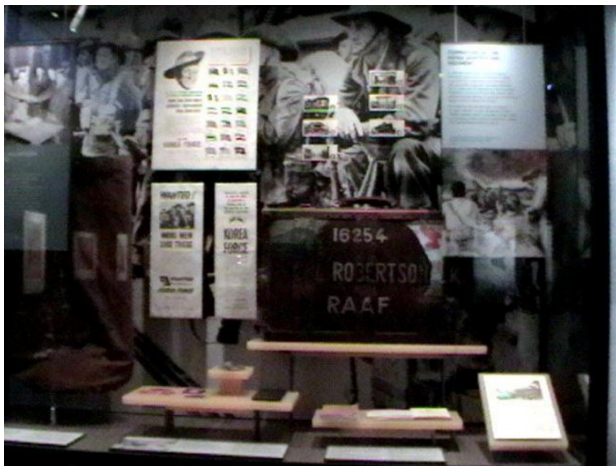
Display illustrating Australian participation in the Korean War, Australian War Memorial, Canberra

In the Australian War Memorial, then, the United Nations Command is centre stage, with the focus (unsurprisingly) being on its Australian contingent.