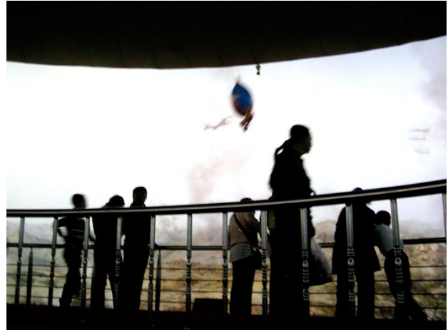
Visitors viewing the cyclorama of the Battle of the River Cheongcheon, Memorial of the War to Resist US Aggression and Aid Korea, Dandong

Like the Victorious Fatherland Liberation War Museum in Pyongyang, the Dandong monument presents an official, state controlled history whose broad outlines are rarely challenged in public discourse. Its rhetoric of victory over brutal American imperialism also echoes North Korean rhetoric. But looking at the interaction between visitors and exhibits in Dandong, I could not help feeling that something else was also going on here. I visited the memorial with two British companions on a holiday weekend, when the building and its forecourt were full of students and young families, many of them stylishly dressed in fashions that could have come from Paris or LA. Several of the children clutched Hello Kitty balloons in one hand as they surveyed the images of devastated Korean cities and of the Chinese victory on the Cheongcheon. Many of the college students were eager to be photographed with us, and seemed much more interested in practicing their English than in perusing evidence of US imperialism on the Korean Peninsula - an imperialism of which we, presumably, should have been seen as representatives. Just one old man (perhaps a veteran of the war) looked on with an expression of quiet disapproval.