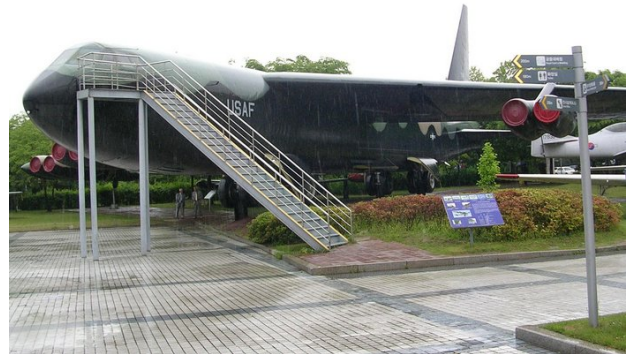
US B-52 bomber exhibited in the grounds of the War Memorial of Korea, Seoul

A visit to a museum is always a conversation. As visitors, we arrive with our own memories and preconceptions, and these influence the way in which the museum's displays speak to us, and the way in which we respond. Sometimes we wander round museums on our own; sometimes in the company of others, whose comments add to the conversation, further affecting the way we see the displays. My perceptions of the War Memorial of Korea, which I visited on a rainy day in May 2009, were influenced by the fact that I had recently completed a short stay in North Korea, and had just come back from a bus trip to the southern side of the Demilitarized Zone (DMZ) dividing North from South. The bus dropped me off in Itaewon, the area of Seoul next to US Army Garrison Yongsan, which occupies two-and-half square kilometers of city centre. I walked down the long road bisecting the base, bordered by high walls topped by razor wire. This took me directly to a side entrance to the War Memorial of Korea, which stands next door to the base. The wide grass-and-paved area around the museum is full of those outsized weapons of war which cannot be accommodated within the museum itself, and to reach the main entrance I walked under the wing of a vast US B-52 bomber: one of the prize exhibits.