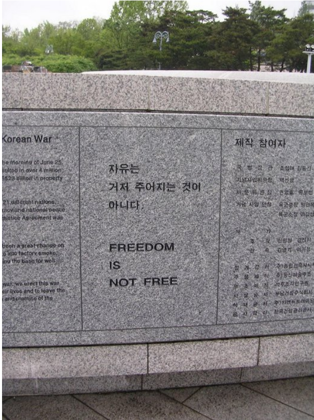
“Monument in Remembrance of the Korean War”, in the grounds of the War Memorial of Korea, Seoul

In the narrative of the war which the Memorial presents to its visitors, South Korea is a small, fragile democracy attacked by the juggernaut of international Communism, and saved by the bravery of the South Korean military and people with the support of their US ally. The information accompanying the displays – both in written form and in ubiquitous multilingual videos, with sound-tracks in Korean, Japanese, English and Chinese – goes out of its way to emphasise that at the time of the war (unlike today) North Korea was the more industrialized and better-equipped half of the peninsula: