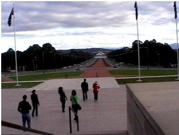
View of Parliament House from the forecourt of the Australian War Memorial, Canberra

The Australian War Memorial occupies a powerful symbolic location in the geomancy of the planned capital of Canberra. Located at the end of one of the major avenues that radiate out from the core of the city - Parliament House - its site embodies the insoluble bond between war and the nation. Within the memorial, though, the space dedicated to the Korean War is relatively small - one-and-half rooms on the lower floor. To reach it, you must pass a long line of photographs recalling Australians' involvement in a whole range of conflicts, from the Boer War to Iraq. Pride of place belongs to the First and Second World Wars. For Australia, as for China, the Korean War was an unwelcome event which arrived just as the nation was recovering from a much larger conflict. Australians, as the memorial's display reminds visitors, were among the first to respond to the United Nations' call for forces to serve in Korea, but the scale of Australia's involvement (compared to that of China or even the United States) was relatively small in terms of total numbers - around 17,000 Australians served in the Korean War, and 339 were killed. [34]