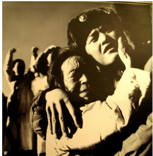
Korean civilian and Chinese volunteer - Photograph displayed in the Memorial of the War to Resist US Aggression and Aid Korea, Dandong

volunteer. Here too, the implicit inequalities are striking: the tall, virile Chinese soldier towering over the frail, wizened Korean woman. At the same time, though, there is something genuinely powerful about this photograph. I try and fail to imagine a similar image of the relationship between US forces and South Korean civilians. It is reminder of the fact that the China which went to the help of the DPRK in 1950 was not a nuclear superpower but was itself a poor agrarian country. The social gap between Chinese volunteers and North Korean civilians was much smaller than that between US forces and local civilians in the south.