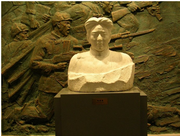
Statue of Mao Anying, Memorial of the War to Resist US Aggression and Aid Korea, Dandong

having been essentially a front for US policy: the term “United Nations Command (UNC)” is always written in scare quotes. The memorial’s narrative also argues that internal disagreements among the states participating in the UNC was a major factor impelling the US to seek a negotiated armistice. [28]