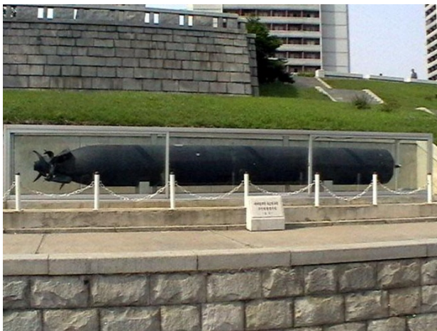
The DPRK claims to have captured this US miniature unmanned submersible vessel (now on display in central Pyongyang) close to its eastern coast in 2004

repeated one, also emphasised in the exhibitions elsewhere in Pyongyang and on the northern side of the dividing line at the truce village of Panmunjeom. There, as in the Pyongyang war museum visitors are reminded of the massive alien military presence on the doorstep of the DPRK: a country which has had no foreign troops on its soil for more than half a century. The abiding impression, far from being one of a confident victor flaunting its military triumphs, is of an embattled society where constant repetition of the word “victory” is a mantra for warding off the unspeakable but always present threat of annihilation.