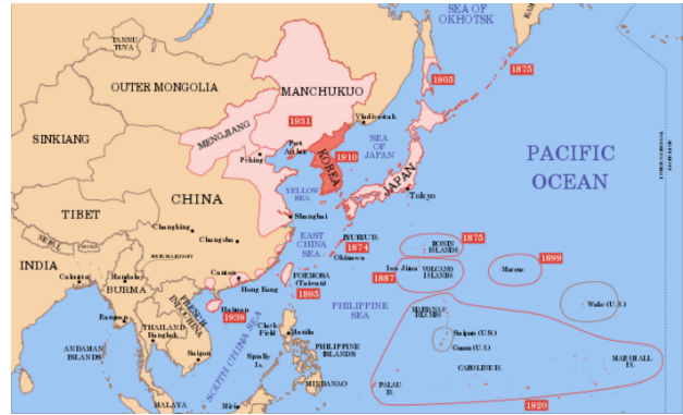
1939 map shows Korea in the Japanese empire

being restrained and disciplined by a rational, globally responsible United States backed by Japan and other nations. To frame the problem in this way, however, is to ignore the matrix of a century's history — colonialism (in the extreme form of attempted national assimilation practiced by Japan), national division, civil and international war, and semi-permanent hostility between it and the global superpower and its allies, accompanied by nuclear intimidation for a half century,[5] and to assume that the unfinished issues of the Korean War, the Cold War, and Japanese imperialism can be set aside while North Korea is somehow brought to heel.[6]