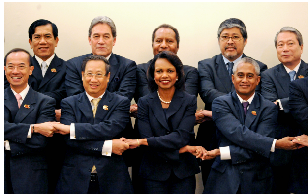
ASEAN Regional Forum leaders meet in 2008

While there is great scepticism about the capacity of both the ASEAN, and the security organisation it spawned – the ASEAN Regional Forum (ARF) – to manage effectively a number of pressing issues,[46] a focus on substantive ‘outcomes’ may miss more subtle processes of socialisation and identification that are steadily transforming perceptions within, and of, the region. Although ASEAN may have originally emerged as a defensive response to the actions of extra-regional powers during the Cold War, its very endurance has given political expression and an increasing sense of identity to what was hitherto a rather arbitrary geographical space. It is also worth noting that there has been no direct conflict between ASEAN members since its inception – an achievement for which ASEAN can take some credit. [47]