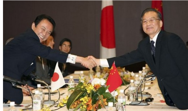
China, Japan, Korea Summit in Kyushu, Dec 13, 2008. Prime Minister Aso Taro and Wen Jiabao of Japan and China.

decade before, but it had been effectively vetoed by American opposition and Japanese pusillanimity. Recently, however, it has re-emerged in the form of ASEAN+3 and become the centrepiece of regional cooperative efforts and the embodiment of a regional consensus on the need for such an exclusive 'Asians only' entity.[28] Not only do a number of observers claim that there are sufficient historical, strategic, political and economic practices in common to generate a common sense of regional identity,[29] but some of the supposedly insurmountable internal obstacles to regional cooperation appear less formidable than once thought. True, Japan and China remain regional leadership rivals, but they are increasingly interdependent economically as a consequence of China's growing economic importance in the region. Moreover, the rivalry is actually encouraging a proliferation of trade agreements and negotiations with other regional players that is helping to consolidate a new East Asian regional order, one that increasingly excludes outsiders and leaves APEC and its 'Asia-Pacific' identity looking increasingly redundant. In this regard, it was highly significant and symbolic of the emerging new order that the US was not invited to the East Asian Summit that will help to determine the region's future institutional architecture and the possible development of an East Asian Community. [30]