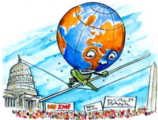
The Washington Consensus

organisations—especially if China’s economic development continues to cement its place at the centre of an increasingly integrated regional economy. I suggest that the US’s hegemonic influence over East Asia is consequently likely to decline and so is the significance of the ‘Asia-Pacific’ region of which it is notionally a central part.