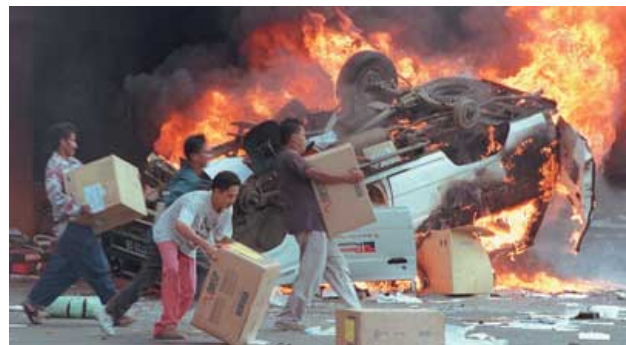
Anti-Chinese riots of 1998

during the May 1998 riots, the PRC Foreign Ministry issued statements that Indonesia should protect its ethnic Chinese. [29] Jakarta accused the PRC of internal interference and Beijing quickly downplayed such statements. Nevertheless, fears were raised that China may act more forcefully in future if ethnic Chinese are endangered. Any future occurrences of anti-Chinese riots would need to be handled carefully by both parties, especially by an increasingly nationalistic PRC.