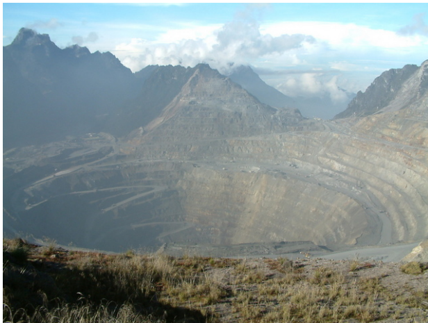
The Grasberg mine

increase the archipelago’s economic prosperity. Attracting foreign capital to spur fresh mineral exploration has become a priority in the face of declining output from the archipelago’s existing oil and gas fields. This decline has forced Indonesia to become a net oil importer and to scale back LNG exports from existing plants. Nevertheless, the country remains a major repository of resources and home to significant reserves of oil, coal, and natural gas, as well as being the world’s second largest producer of copper and tin and the fourth largest of nickel. The Grasberg mine in Papua remains the world’s largest gold mine, and Indonesia is also a major exporter of palm oil, cocoa, and coffee. Until the recent global recession, strong demand from China and India was driving prices for many of these commodities up to record levels. With China becoming one of the biggest investors in them, Trade Minister Mari Pangestu wants to position Indonesia to ride the bandwagon of China and India’s economic growth.