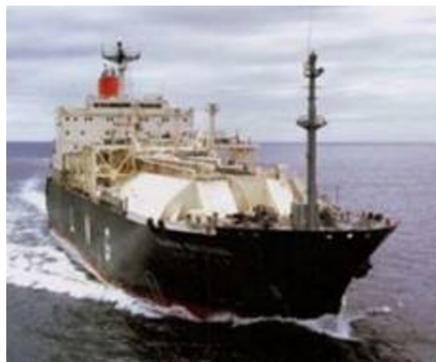
Japanese LNG tanker

For example, in March 2008 it was revealed that Japan has agreed to pay around U$16-18 per MBTU (million British thermal units) to renew the Bontang LNG contracts. [2] This figure, which surprised analysts, set a new record price for Asian LNG beating the previous high of US$11 per MBTU agreed between state-run Korea Gas and Qatar under a 20-year LNG deal signed in November 2006. Analysts have been concerned that such high prices might be unsustainable, in part due to a raft of new LNG schemes projected to come onstream around 2015. Alarmed by safety fears in its nuclear power network, Japan did not appear to have many viable alternatives and Indonesia was able to take advantage of such vulnerability to drive the price up.