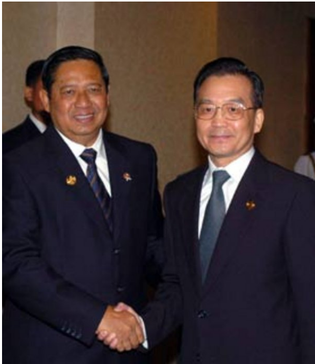
Indonesian President Yudhoyono welcomes Chinese Premier Wen Jiabao to Jakarta

addition to energy investment however, Jakarta is trying to encourage both countries to help overhaul Indonesia's physical infrastructure in order for the archipelago to be competitive in many different economic spheres rather than just commodities exports. Whilst Sino-Indonesian diplomatic relations are breaking new ground, it remains to be seen if the two sides' objectives and goals will be mutually compatible.