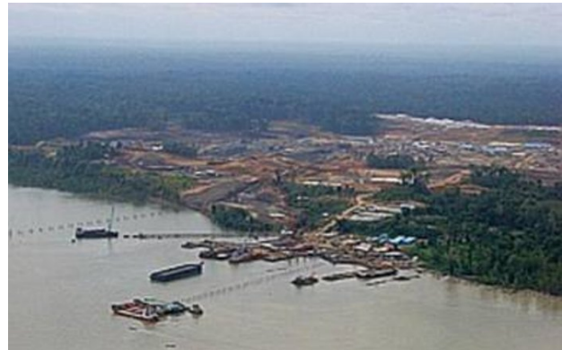
Tangguh LNG facility under construction

become politicised. Whilst the PDI-P has stressed that both President Yudhoyono (SBY) and Kalla were also serving in the Megawati government at that time, the Tangguh issue could easily end up as ammunition for SBY and Kalla to attack Megawati during the presidential race of 2009. Such a scenario could complicate relations with China.