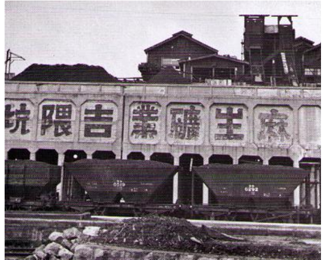
Ore cars at the Aso Yoshikuma coal mine in Fukuoka Prefecture, where 300 Allied POWs were forced to work in 1945