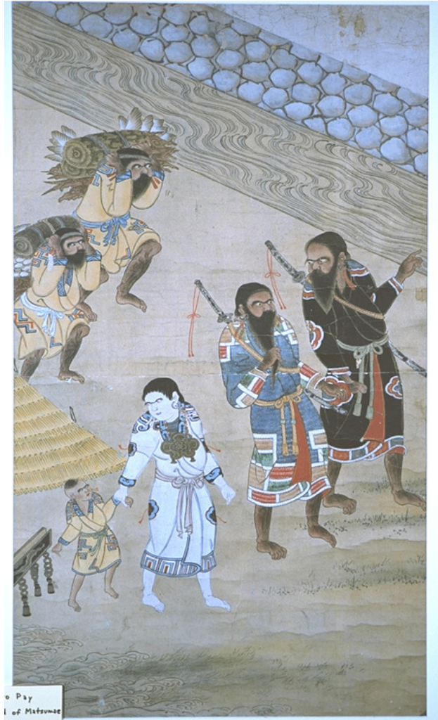
Ainu group in a Japanese representation in Edo

The formulation of a cultural hierarchy seen in this passage provided the logic that enabled the Japanese state to justify the necessity for its people to appropriate and rule the territory of Hokkaido in place of the Ainu by making the former the assumed subjective motor-force of this “opening,” while rendering the latter into an ethnicity ( minzoku ) that had “not yet managed to escape a savage and uncivilized stage.” Further, the new anthology of Hokkaido history compiled in 1937 insisted on the point that the “opening” made it possible for the Japanese to “enlighten the Ainu,” who had “for a long time continued their primitive lifestyle,” through the imperial assimilationist educational policy ( kominka kyoiku ) and it brought about a real possibility for the Ainu to “be granted universal brotherhood, and treated as national citizens.” [3]