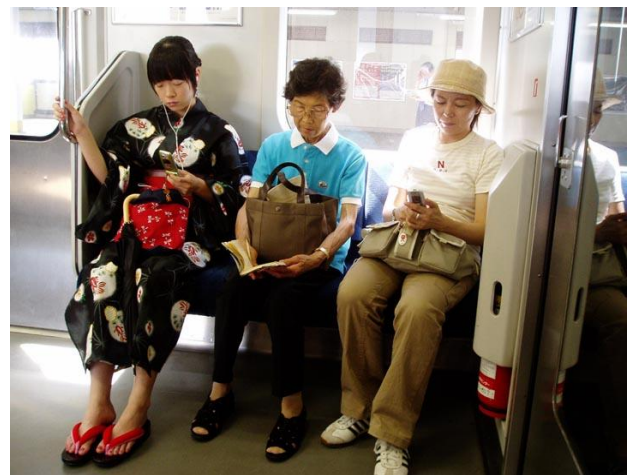
10Above: Three generations and remediations of personalised media (keitai version).

communities. Indeed, these processes are particular to the Asia-Pacific — the conspicuous feminisation of customisation has a long history in the uptake of technologies in the region and is not comparable to the European models. Through the localised imaging communities we can gain insight into the emerging forms of mobile media and how they are shaping, and being shaped by, the burgeoning cartographies of personalisation in the region.