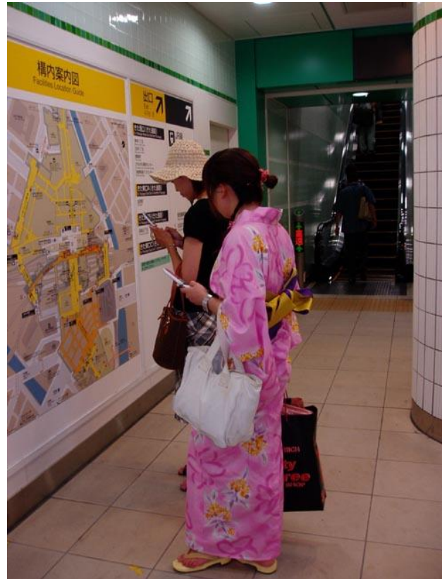
Dislocated localisation (Larissa Hjorth 2004)

In the third section, ‘Beyond “The New Rich”: Re-imagining the region’, we consider how micro imaging communities (such as those that use / deploy UCC) can reveal macro cartographies of personalisation as part of broader post-industrial lifestyle movements. Here I reflect upon emerging forms of post-industrial lifestyle narratives that have arisen since the pivotal 1997 economic crisis and how, by engaging in the micro imaging communities, we can begin to reconceptualise current models of cultural consumption and production within the Asia-Pacific.