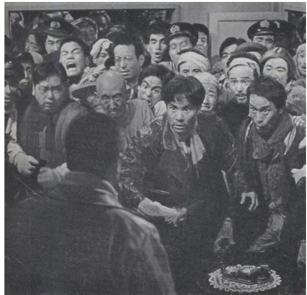
Strike the Hour