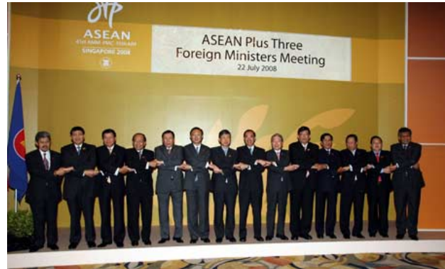
ASEAN foreign ministers meeting, 2008

Relations with ASEAN are important for securing Tokyo's economic leadership in East Asia. Through ASEAN, Japan seeks to maintain its position as the regional economic power and seeks to expand its international political influence in the world. In order to pursue closer relations with ASEAN states, Japan has emphasized soft power diplomacy for a decade. Like China, foreign aid, economic networking and people-to-people contact via social/cultural exchanges are the core of Japan's soft power resources. Tokyo's economic and political contributions toward ASEAN institutionalization and integration have bettered its image among Southeast Asian nations and their people [17].