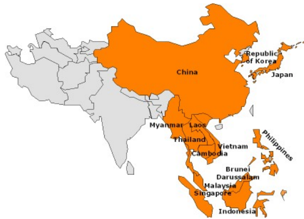
ASEAN + 3

Regional leadership matters. It can facilitate cooperation among states and bring about a prosperous common future. Nevertheless, the struggle for leadership may lead to serious rivalry and regional instability. In East Asia, the quest for leadership has been controversial. Northeast Asian powers such as China, Japan and Korea have long been regarded as potential leaders striving to secure national interests by expanding their influence over their southeast neighbors. However, in the Asian financial crisis of 1997 none of these countries was able to play a dominant role, resulting in a “leadership deficit.”[1] To some extent, the Asian financial crisis did witness a new architecture of collective leadership in East Asia. “ASEAN Plus Three” (APT), inclusive of ten ASEAN member states in addition to China, Japan, and Korea, convened in Kuala Lumpur in late 1997, pointed toward a model of co-governance among regional powers. Based on this framework, the Chiang Mai Initiative (CMI) and Asian Bond Market Initiative (ABMI) resulted in successful responses to the financial catastrophe. Ten years after its inaugural summit, APT cooperation has become the most effective track for regional cooperation.