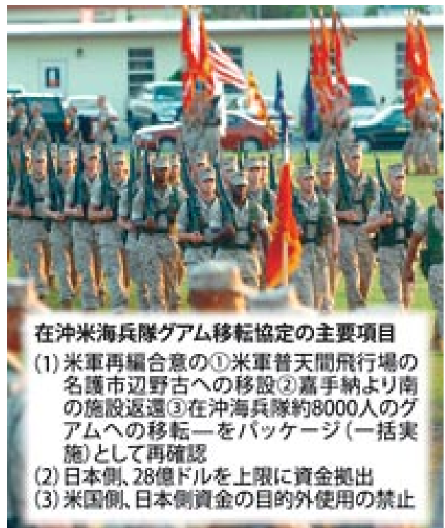
Ryukyu shimpō (16 February 2009) reports