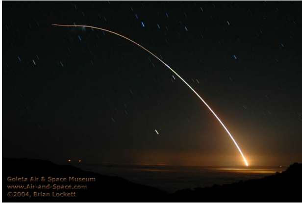
North Korea missile test July 4, 2006

President Barack Obama is now the one to pick up the pieces of a failed strategy that left Pyongyang with a small arsenal of nuclear weapons and a big plutonium reactor still cranking out nuclear fuel. In their discussions with Selig Harrison and others, the North's leaders have now cranked up a maximum position, presumably in anticipation of negotiations with the new administration: they want to keep their weapons, test their long-range missiles, get two light water reactors in return for shutting down the plutonium complex yet again, and they don't care whether the Americans like all this or not, or whether a U.S. Embassy ever materializes in their capital or not. They are nothing if not hard bargainers, and no doubt they will climb down from these maximal positions. But it is unlikely that they will give up the a-bombs that are the residue of Bush's disastrous failures. Can we live with a nuclear-armed North Korea? It looks like we will have to, various hard-line spluttering in Washington notwithstanding. There never was a military solution in Korea, as we should have learned in 1953, and there certainly isn't now. So welcome to the era of benign neglect. Bruce Cumings