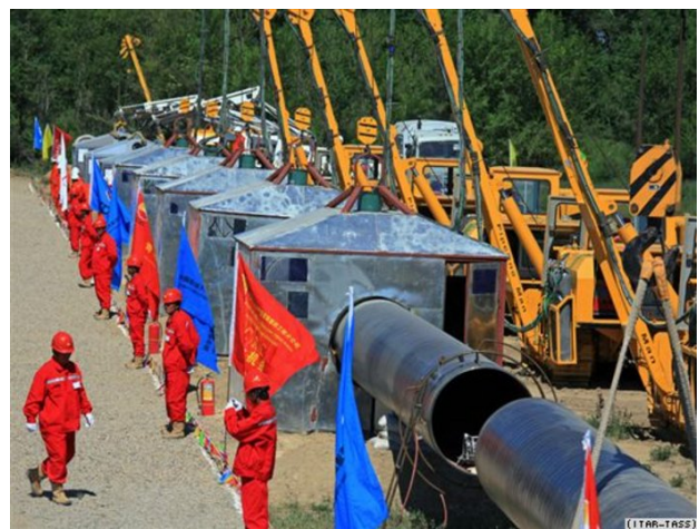
The unveiling ceremony for the

In 2008, Kazakhstan and China agreed on jointly developing oil and gas reserves on the continental shelf of the Caspian Sea, while China's Guangdong Nuclear Power Co and Kazakhstan's state nuclear firm Kazatomprom agreed on boosting uranium output in their joint venture.