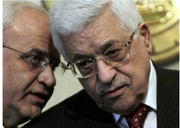
Palestinian President Mahmoud Abbas, right, consults with Chief Palestinian negotiator Saeb Erekat, left

The visit came several days after the Palestinian leadership announced a medium-term plan to go to the United Nations to ask for a declaration of a Palestinian state within 1967 borders (i.e. in the West Bank and Gaza). The move comes because the Obama administration's attempts to restart the peace process have failed. The Palestinian leadership had made an Israeli settlement freeze a prerequisite for new talks, and so refused to sit down with the Israeli government as long as the latter continued to build on Palestinian land (Palestinian Authority President Mahmoud Abbas has dismissed Israel's moratorium on new settlement construction because it did not apply to several thousand housing units and public buildings in the West Bank and to eastern Jerusalem.