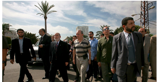
Richard Goldstone (in short-sleeve shirt), Head of the UN Fact Finding Mission on the Gaza Conflict, which produced the September 25, 2009 "Goldstone Report"

It seems clear that with Israel-Palestinian negotiations long stalled, while Israel continues its inexorable building and consolidation of illegal settlements, that the Japanese diplomatic position, if it is a serious one, requires a focus on the positive steps the world community can take (such as the Javier Solana proposal) to finally implement 242.