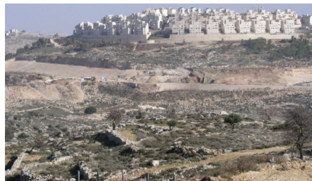
Israeli settlements in the West Bank designated for development funding in December 2009

harder." United Nations Secretary-General Ban Ki-moon reacted to Gilo by affirming "his position that settlements are illegal, and calls on Israel to respect its commitments under the Road Map [a peace plan that foresees two Israel and Palestine states living side by side in peace and security] to cease all settlement activity, including natural growth." The current Swedish president of the European Union stressed that the EU's position is that "settlement activities, house demolitions and evictions in East Jerusalem are illegal under international law." Importantly, the president also noted that "such activities... threaten the viability of a two-state solution" and that the EU "has never recognized the annexation of East Jerusalem in 1967 nor the subsequent 1980 basic law," in which Israel claimed Jerusalem, including the occupied eastern half, as its "undivided" capital.