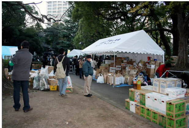
Supplies for Hakenmura

prepare the village, which opened at Hibiya Park, Tokyo’s relatively small “Central Park,” over the week from December 31st to January 5th (at which date public offices for the unemployed were supposed to open). The organizers distributed food and lodging, provided counseling and employment consulting services, and helped the residents apply for welfare benefits. The residents pitched tents for their lodgings, but the space was cramped and it was hard to sleep with nighttime temperatures around the freezing point.