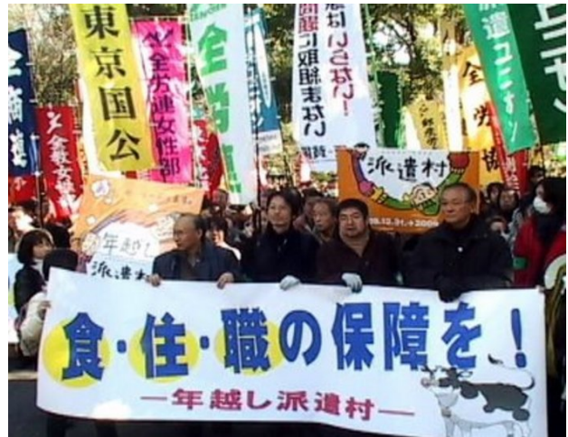
Hakenmura residents march to the Diet on January 5, 2009 demanding food, housing and jobs

center of downtown Tokyo. This news drew an unexpectedly wide range of attention and generated unprecedented reactions, and its drama symbolized the recent suffering of Japanese workers and their families, especially “the working poor.” The entire episode suggests there has been a turning of the tide in Japanese labor politics.