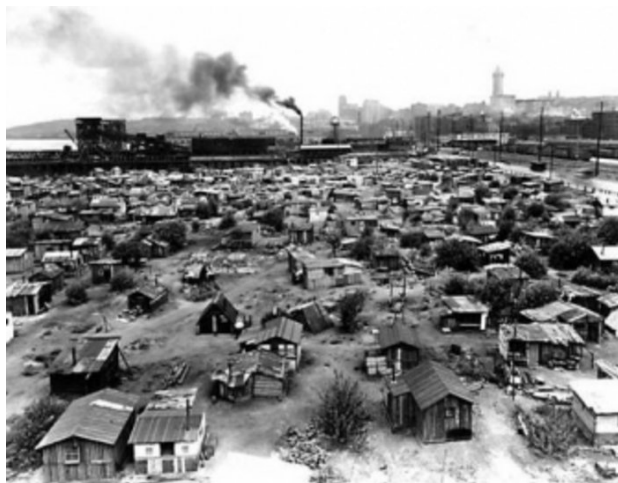
An American depression: Hooverville

“Hooverville” was the term coined to describe the numerous shanty towns created by homeless men during the Great Depression in various American cities, an ironic reference, of course, to president Herbert Hoover. Nearly 80 years ago the spectacle of these Hoovervilles pushed Roosevelt and American labor politics toward the New Deal. In this light, one is led to wonder about the political significance of the similarly ironically named “New Year Hakenmura.” Does it indicate a tipping point in Japanese labor politics?