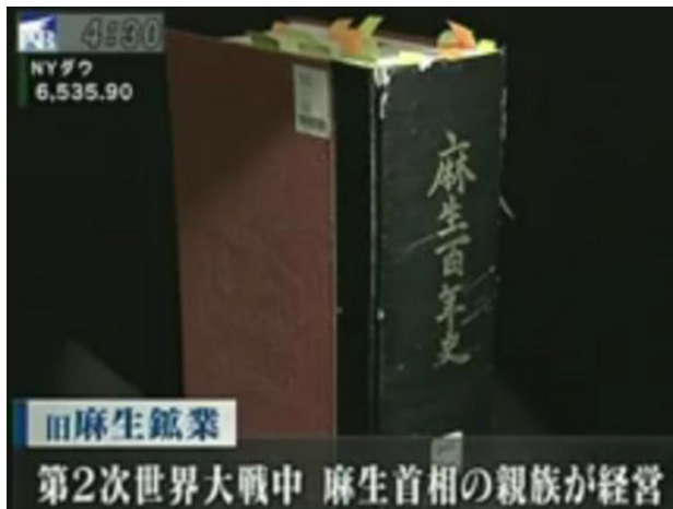
Published by Aso Taro in 1975, The 100-Year History of Aso does not mention the company’s POW workforce