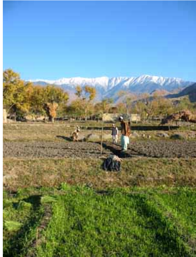
Peshawar-kai agricultural project in Dara-e-Noor: “Go where others dare not go. Do what others dare not do.”

Another possible factor is that the Japanese government had been mulling a Self-Defense Forces (SDF) deployment to the Afghan interior in recent months. Although the plan for a Japanese military deployment was scrapped in mid-July, the prospect of such a mission was reported in the international media on several occasions. In early June, when it appeared likely that such a deployment would be authorized by the government, Dr. Nakamura Tetsu, the leader of the Peshawar-kai, told the media that if the SDF moved in, his aid organization would have to move out: “What the locals need are bread and water. Military activities will resolve nothing. Anti-Japanese sentiment will increase and we will not be able to protect our Japanese staff... The absence of Japanese troops in Afghanistan has helped local people trust Japan, leading to our safety. Sending the SDF amidst the worsening security situation would be foolish.”