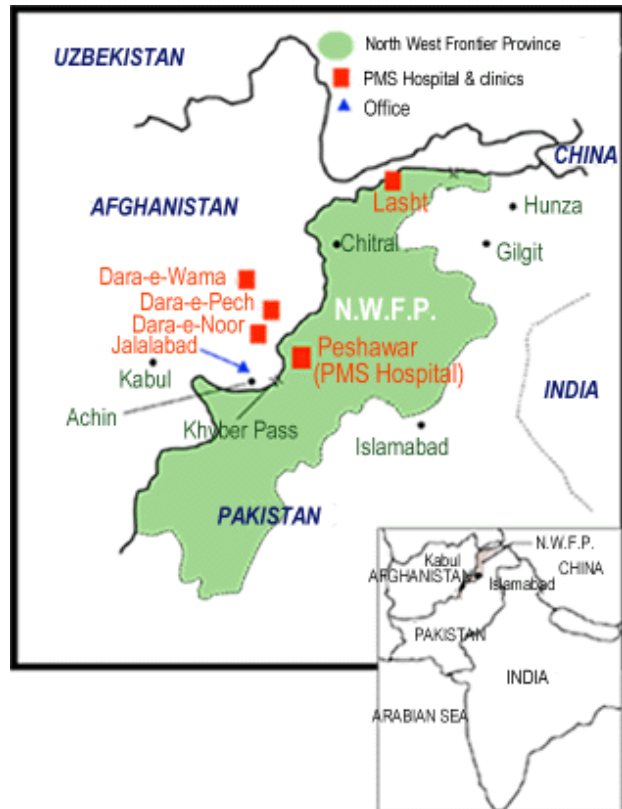
Map showing Peshawar-kai projects in Afghanistan

This year has seen a general deterioration of security in Afghanistan. The Agency Coordinating Body for Afghan Relief, which coordinates NGO groups working in Afghanistan, reports that nineteen NGO workers were killed by Taliban militia forces and bandits between January and July, surpassing the total death toll in 2007.