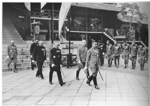
Hirohito at Yasukuni Shrine in 1935