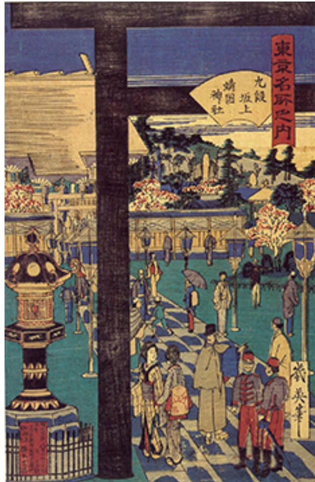
Yasukuni Shrine in a Meiji woodblock

Yasukuni Jinja both is and is not a “Japanese” problem. As a Shinto shrine with enduring historical links to the emperor—established in 1869 “to commemorate and honor the achievement of those who dedicated their precious life for their country”—and with a deep association with every Japanese war from the Meiji era through the Asia Pacific War, it evokes Japanese tradition linking Shinto, emperor and war. [1] Yet to see it simply as Japanese is to neglect a range of features characteristic of contemporary nationalisms. This view ignores important regional and global forces, particularly the role of the United States, in shaping politics and ideology from the Japanese occupation to today.