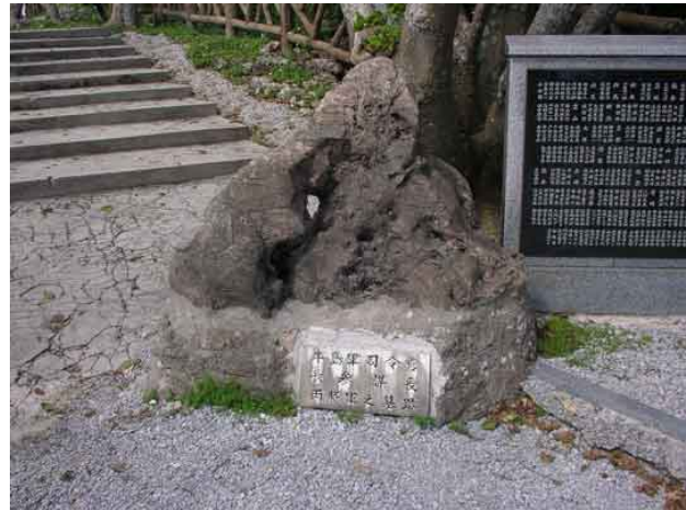
Memorial to Ushijima and Cho

The Japanese government, displaced from Okinawa by US forces, worked to lay claim not only to the souls of mainland Japanese soldiers who died, but also to those of Okinawan soldiers and even civilians. USCAR documents record the fact that in January 1964 “the Japanese cabinet decided to confer court ranks and decorations posthumously to World War II war dead, including approximately 52,700 Ryukyuan (Okinawans).” [10]