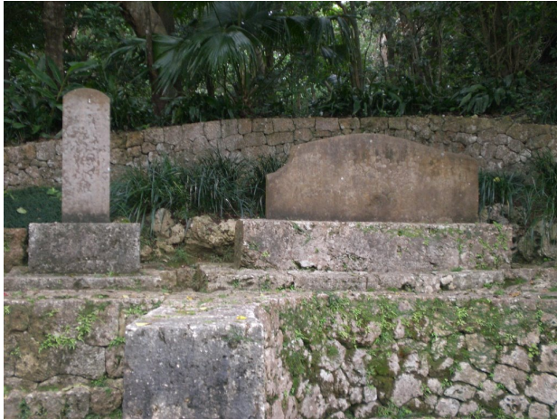
Monuments at Shikina

If Konpaku was the creation of Okinawan villagers, Shikina was primarily the product of GRI (that is, the US administration of the Ryukyu Islands) under pressure from Tokyo. Yet we cannot simply conclude that Konpaku embodied Okinawan sentiment while Shikina was the expression of Tokyo and/or the US. Both sites honored the military and the civilian dead, Japanese and Okinawan, although as we will note, with quite different emphases.