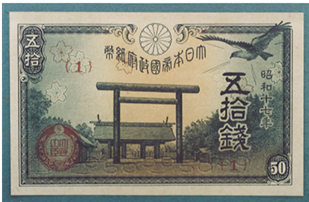
Shrine on 50 sen bill, 1943.

Another kind of alchemy goes hand in hand with the alchemy of exaltation. This is the alchemy of amnesia . . . forgetting atrocities and war crimes, forgetting the treatment of the military comfort women, of forced laborers, of those whose lands were invaded, homes destroyed and families slaughtered in the name of emperor and empire. While the military dead were enshrined as kami at Yasukuni shrine and their families received state pensions, the hundreds of thousands of civilian dead and many more injured were forgotten: neither shrine nor state commemorated their sacrifice or attended to the needs of their families. If nationalism has everything to do with invented tradition, as Benedict Anderson has compellingly argued, it is equally about suppressed or forgotten traditions.