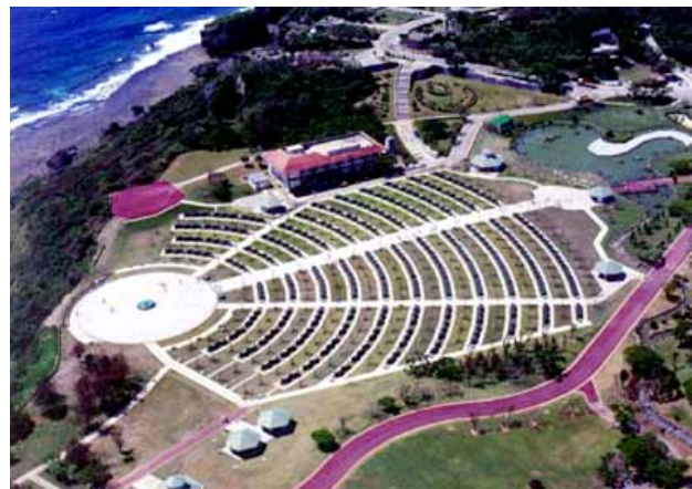
Cornerstone of Peace. More than 237,000 names of deceased civilians and soldiers are inscribed.

Governor in 1990, Okinawa moved to create the Cornerstone of Peace (Ishiji) at Mabuni Hill, inscribing in stone the names and nationality of the 239,000 combatant and noncombatant dead of all nations: Japanese, American, Korean, Taiwanese, British, and Okinawan among others. This cosmopolitan and inclusive approach, with its distinctive Okinawan roots and close attention to the civilian victims of the Battle, stands out among the world's memorials. The Cornerstone contains this inscription looking beyond the nationalist passions of war: "The Cornerstone of Peace" is a place to remember and honor the 200,000 people who lost their lives in the Battle of Okinawa and other battles, to appreciate the peace in which we live today and to pray for everlasting world peace."