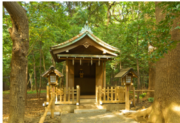
Chinrei-sha, Spirit-pacifying shrine

compact to secure the compliance of soldiers and civilians to fight and die for goals proclaimed by the state. [4] If the symbolism of Yasukuni is distinctive in its particulars, it is but one such manifestation of a global phenomenon of state-sponsored war nationalism pivoting on the military war dead. With the enshrinement of Japan's 2.46 million military dead, the senbotsusha , that is, all who died in uniform from Meiji through the Pacific War (2.1 million in the Pacific War), Yasukuni reinforced its position as the central symbol linking emperor, war, the military and empire. John Breen's sensitive analysis of the shrine's rites of apotheosis and propitiation well documents the nexus of power and ideology that gives the shrine its special place in contemporary Japan. [5]