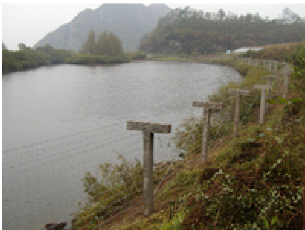
Dandong. Barbed wire fence separates China from North Korea (left)