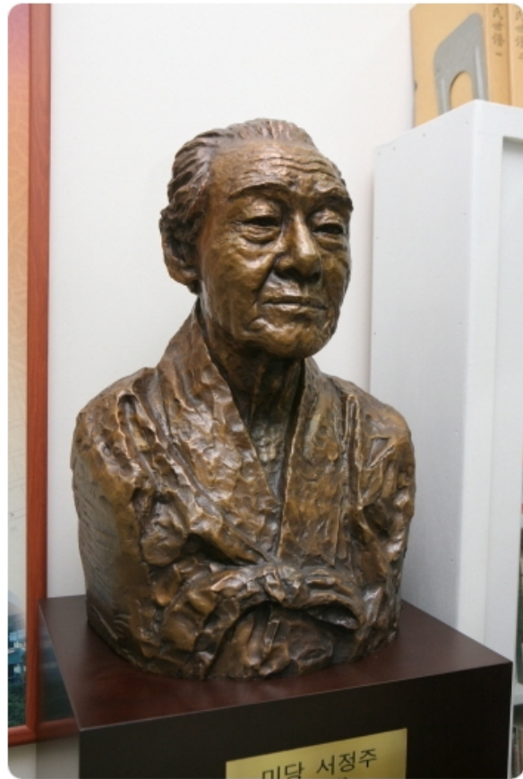
A bronze statue of Sō Jōng-ju. While respected as Korea's greatest poet, the controversy surround his work as a pro-Japanese writer continues to rage in Korea.

Sō Jōng-ju, perhaps post-liberation Korea's greatest poet, published a short story called “Postman Ch'oe's Military Longing” in October 1943, conveys understanding of the national identity “Japanese” as the internalization (mi ni tsukeru koto) of order and discipline. [8] In Sō's story, the protagonist, Ch'oe, a “postman in a small town by the sea in southern Korea,” is desperately trying to acquire Japanese identity. Ch'oe is a “reliable and trustworthy man of average build,” who delivers the mail not only in his own village, but also far and wide to “small villages in the deep mountains and down by the seashore.” Although his wife has passed away, he has a “mother who is blind in one eye,” and “a son who is a second-year student in elementary school.”